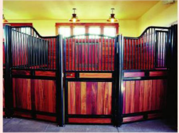
STABLE DOORS & WINDOW