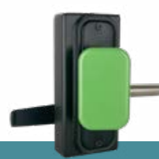
Superlock 2.0 BQDGRR