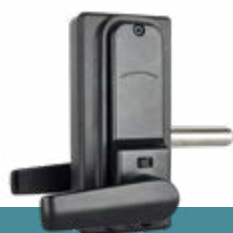
Superlock 2.0 BDGSRR