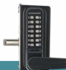
Superlock 2.0 BDGWRR