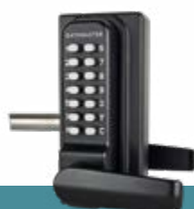
Superlock 2.0 BDGRR