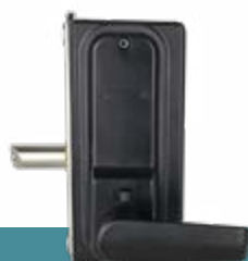
Superlock 2.0 BDGSWRR