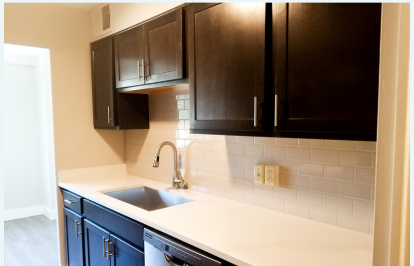
Beautiful modern finishes in renovated suites include quartz countertops, subway tile, luxury vinyl flooring and new lighting along with other features