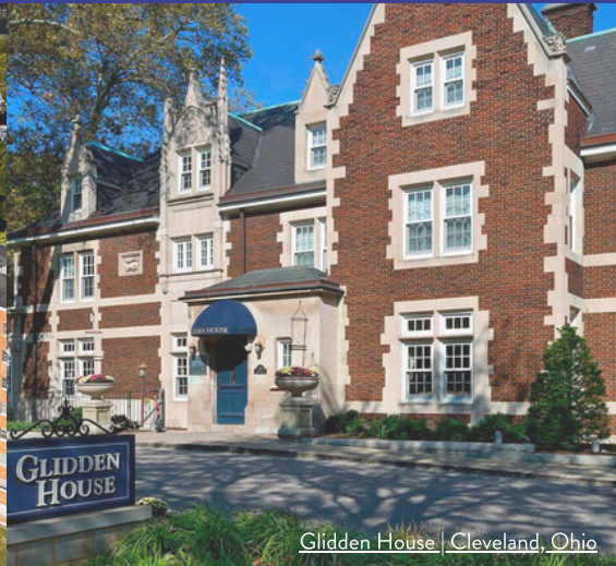
Glidden House | Cleveland, Ohio