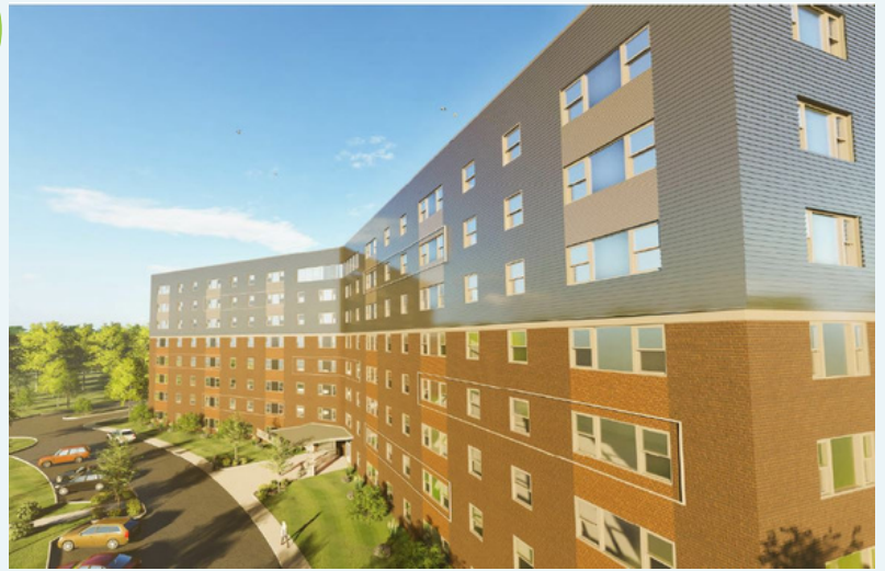
Rendering of proposed facade building wrap that was approved by the city of Cleveland Heights

Plans are now underway for a new facade wrap on the building's exterior. The proposed update is being designed to give the exterior a modern look. If the project is funded, the next step will be new windows with even greater views of University Circle, downtown Cleveland and Lake Erie.