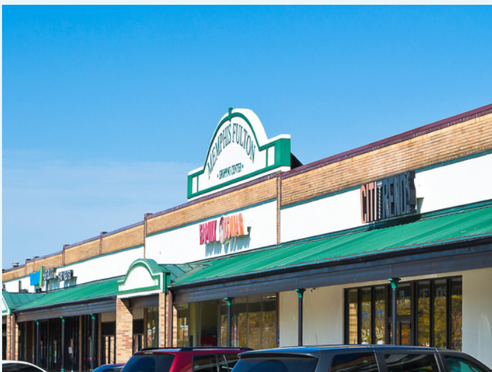
Memphis Fulton Shopping Center facade today