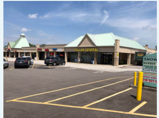
Snowville Plaza in Cleveland, Ohio