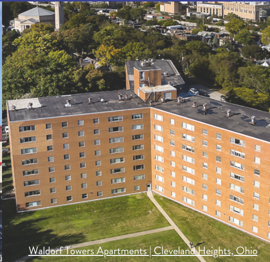
Waldorf Towers Apartments | Cleveland Heights, Ohio