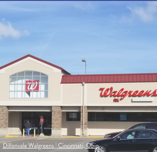
Dillonvale Walgreens | Cincinnati, Ohio