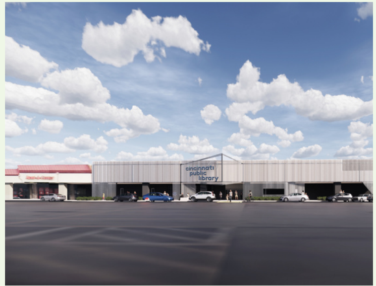
Proposed facade renovation for Deer Park Branch expansion at Dillonvale Shopping Center

The Deer Park branch of the Cincinnati Public Library system has served the community from locations at the Dillonvale Shopping Center since 1972. It has twice expanded. The last time was in 1997, when the library moved into the 4,105 SF space it currently occupies. The success of the branch helped identify it as a priority development in the library system's Master Plan. When the library announced it would move into the nearly 25,000 SF space at Dillonvale, we at Paran were thrilled.