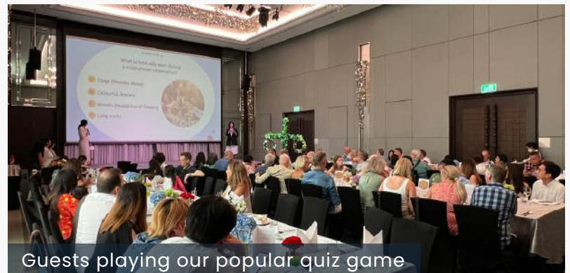
Guests playing our popular quiz game