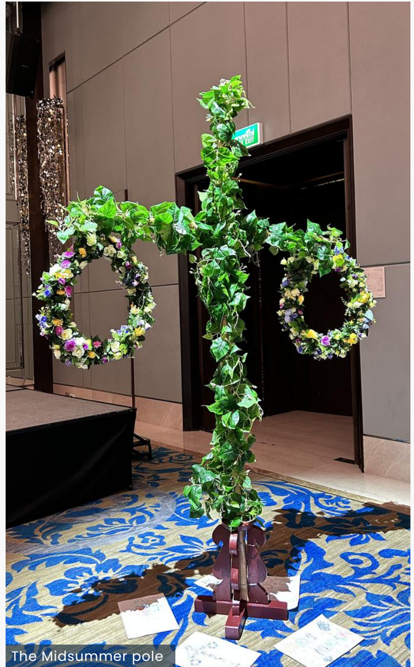
The Midsummer pole

The highlight for many which was the final section of our Midsummer Lunch was our coveted raffle game. This year we were delighted to give away some fantastic prizes and we congratulate all the lucky winners. Once again, we would also like to thank all the raffle prize sponsors Aleenta Phuket,