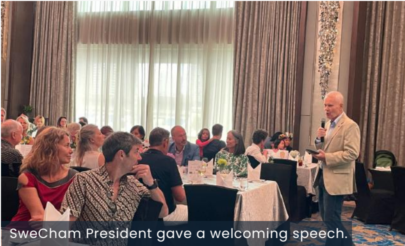
SweCham President gave a welcoming speech.