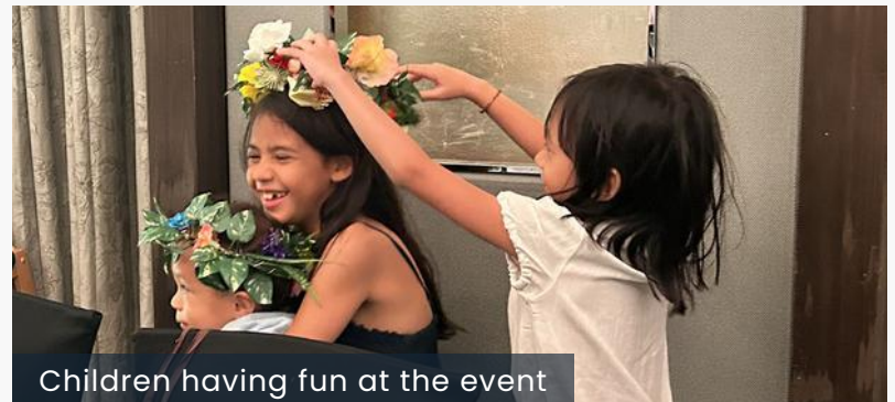
Children having fun at the event