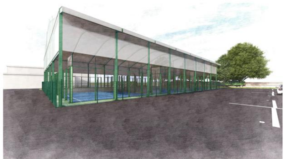
Proposed Padel Tennis Courts - Southern Elevation