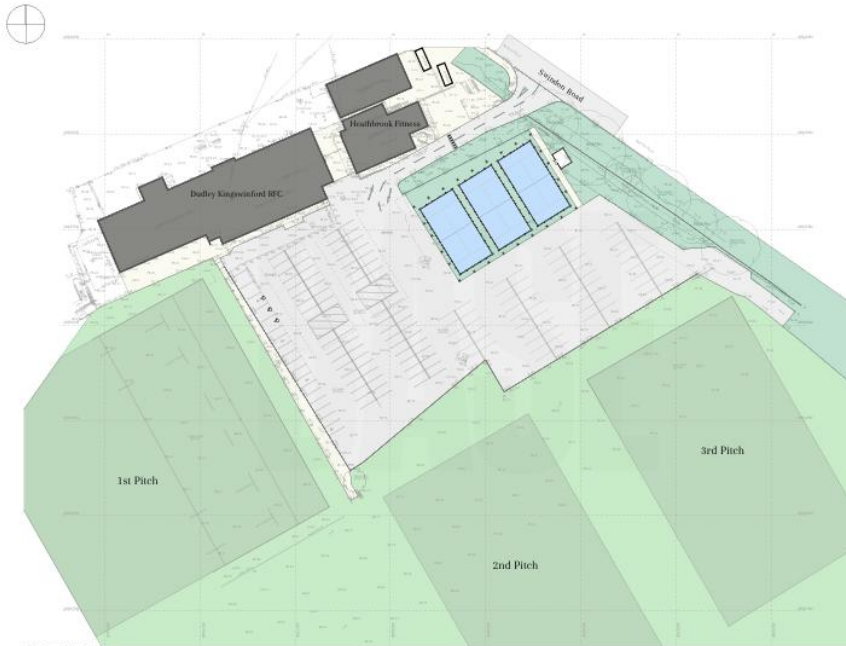
Proposed Site Plan 1:500