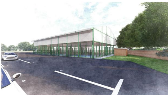
Proposed Padel Tennis Courts - Southern Elevation