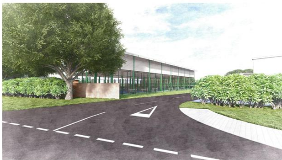
Proposed Padel Tennis Courts - View from Swinton Road