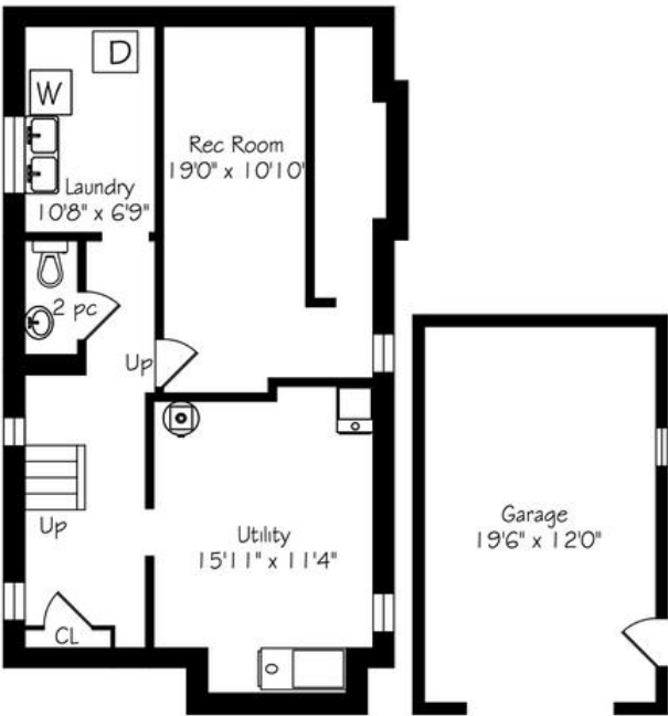
Lower Level 718 Square Feet