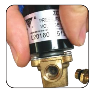
Solenoid valve with built-in filter, stops micro chippings, avoid water drops in cup filling and spittoon rinsing