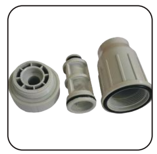
Bigger water filter ensures water flow capacity, good quality filter stops micro chippings, easy for maintenance