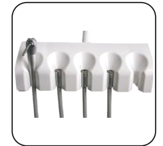
High quality and durable HP tubing sleeves