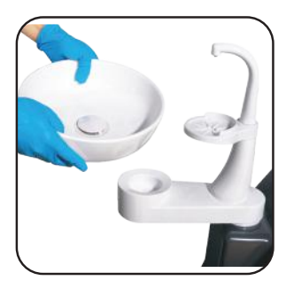
Easy to clean removable ceramic spittoon