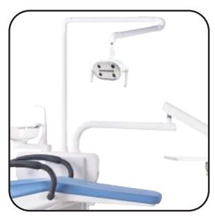
Separate light arm and instrument arm