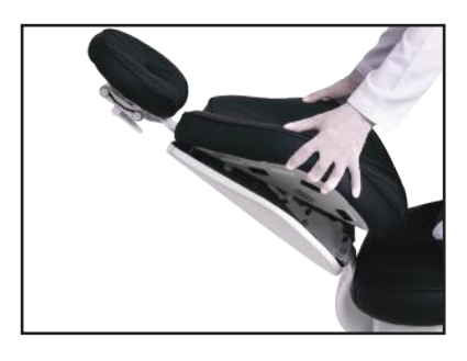
EASY FIX SYSTEM

It has Easy Fix System for effortless cleaning of the dental chair.