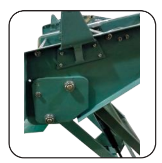
High quality rust proof painting and electroplating. All stainless steel screws and washers for high efficiency