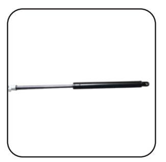
Oiliness gas spring for balancing chair moving. Low noise & durable