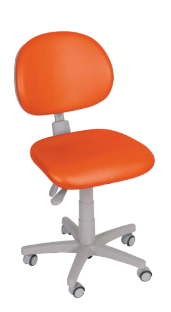
Zero Backache Stool for Doctor Comfort

CE / EC ISO 13485:2016 / EN ISO 13485:2016