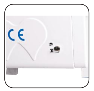
Pull-push water exchange valve for city water and fresh water