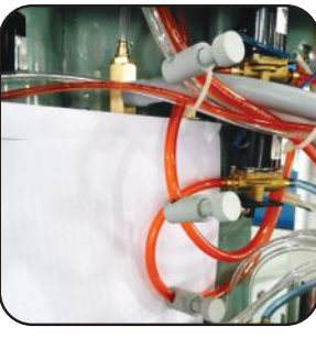
3* regulators for controlling the water flow of cup filling. Spittoon rinsing and air flow of air suction