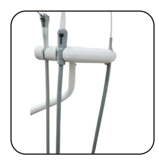
High quality and durable suction tubing