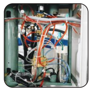
High quality tubing resists acid-base, SMC tubing resists high temperature