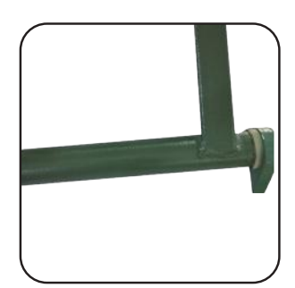
Nylon washer & oiled bearing in movement joint for low noise & durability