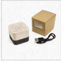
WHEAT RECYCLED EC148 Wireless Speaker