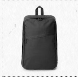
NOMAD MUST HAVES RENEW BGR100 Digital Nomad Backpack