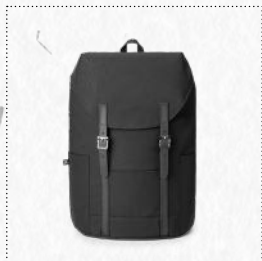
NOMAD MUST HAVES RENEW BGR102 Flip-Top Cooler Backpack