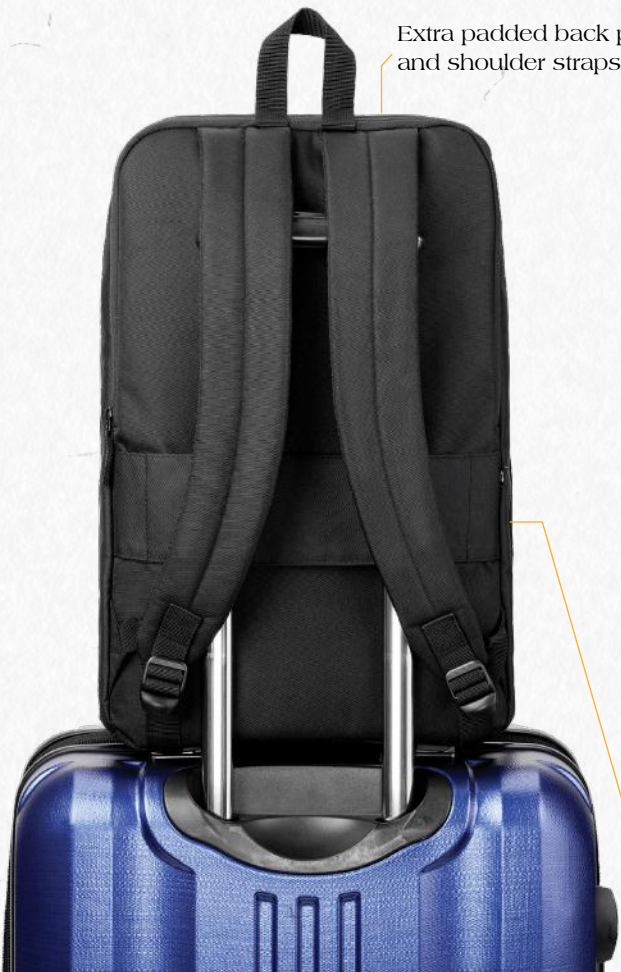
Extra padded back panel and shoulder straps