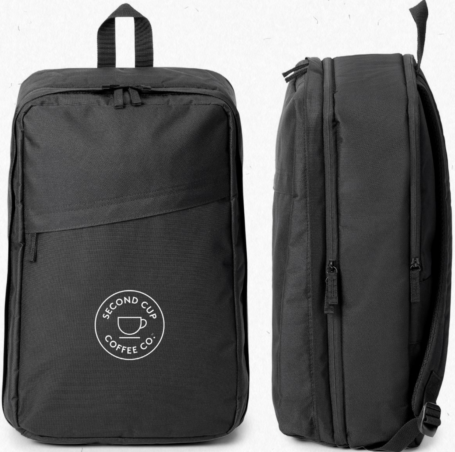
Easy grab items (large front pocket)

Standard Packaging: Individual plastic bag