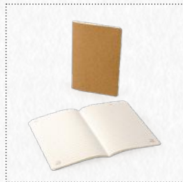
CORK EC145 Single Meeting Journal