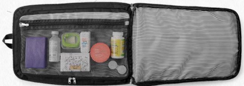
Toiletries/work essentials compartment