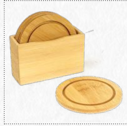
BAMBOO EC136 4-piece Coaster Set