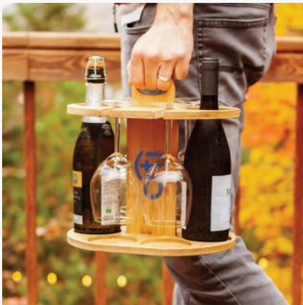
Shown with optional silk screen branding on the bridge center.

This 100% natural Bamboo bottle and glass organizer is easy to assemble for display on any flat surface. It's fitted with a carrying handle, two dedicated spots for standard 750 ml bottles and 4 dedicated spots for stemmed glasses. This eco-friendly organizer also doubles as a charming countertop display, showing off the default laser touch centered on the top of the organizer. (Wine bottles and glasses not included).