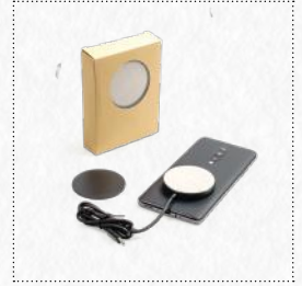
WHEAT RECYCLED EC150 15W Magnetic Wireless Charging Dock