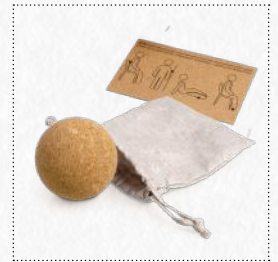
CORK EC143 Massage Ball