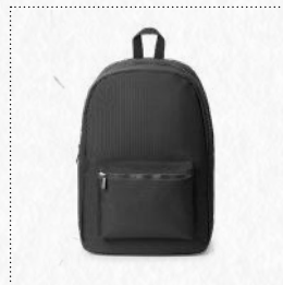
NOMAD MUST HAVES RENEW BGR103 Insulated Tech Backpack