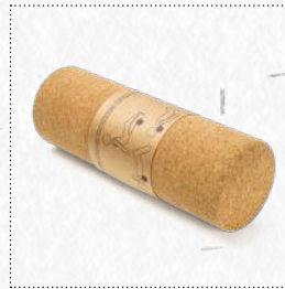
CORK EC142 Fitness Roller