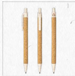
CORK EC146 Ballpoint Pen