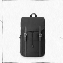
NOMAD MUST HAVES RENEW BGR101 Flip-Top Mini Backpack