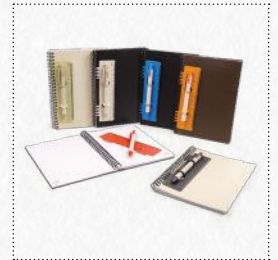
BAMBOO X COFFEE EC147 Recycled Journal /Pen Combo

NOTE: Bamboo is a natural fiber; therefore, noticeable shade variations and grain patterns may be apparent within orders of the same item. Due to our high standards of quality control, we must advise that slight irregularities in the bamboo of this item may result in imprint imperfections but are consistent with the natural look of the product.