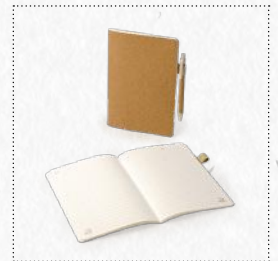
CORK EC151 Single Meeting Journal /Ballpoint Pen Combo