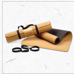
CORK EC141 Yoga Mat