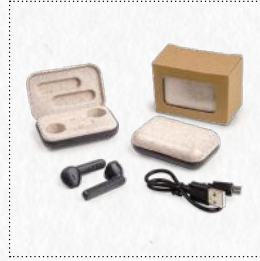
WHEAT RECYCLED EC149 TWS Wireless Earbuds