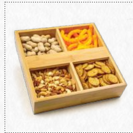
BAMBOO EC140 4-section Multi-Function Tray