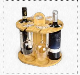
BAMBOO EC138 Bottle/Glass Organizer