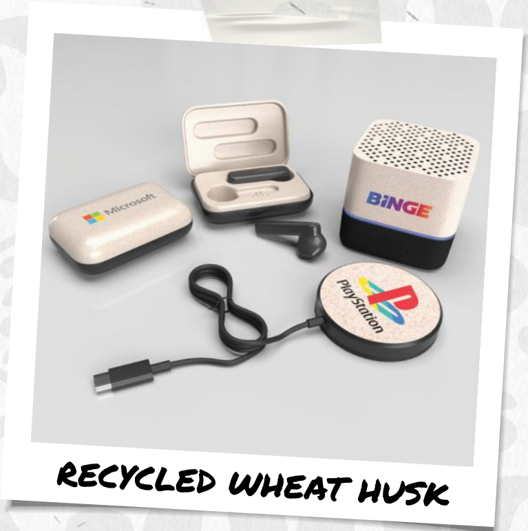
RECYCLED WHEAT HUSK