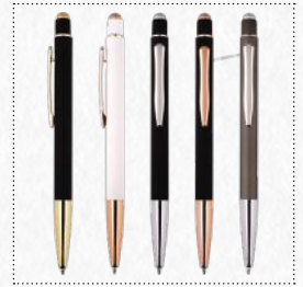
TOP NOTCH REFLECTION I154 2-in-1 Ballpoint Pen /Stylus