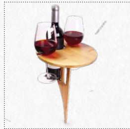
BAMBOO EC139 Foldable Outdoor Wine Table