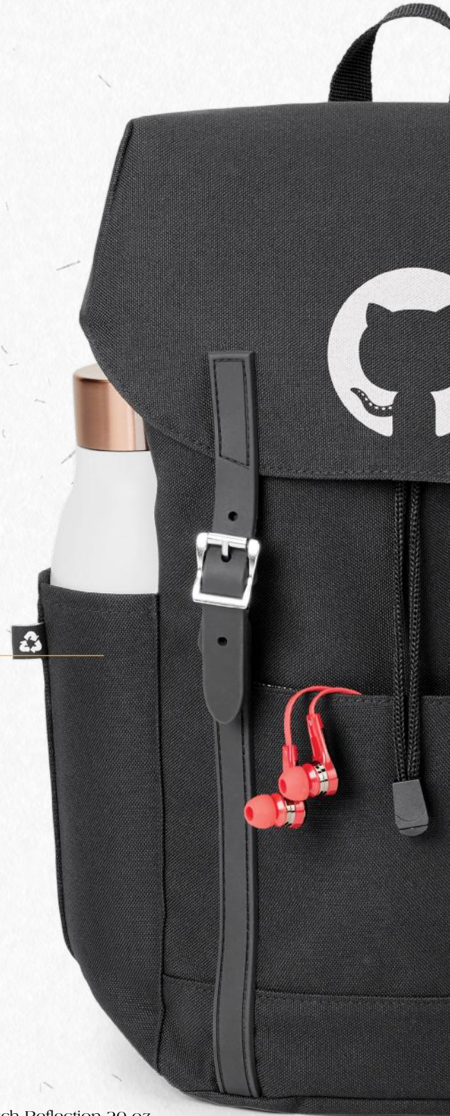
Image shown with Top Notch Reflection 20 oz Stainless Steel Bottle (DW306) and Dino Ear Bud Kit (T307)