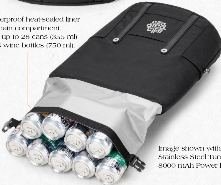
Image shown with Crunch Time 18 oz Stainless Steel Tumbler (DW300) and Sol Donald 8000 mAh Power Bank (UL certified) (T1234)

Waterproof heat-sealed liner in main compartment. Fits up to 28 cans (355 ml) or 5 wine bottles (750 ml).