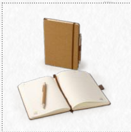
CORK EC1446 Hard Cover Journal Combo