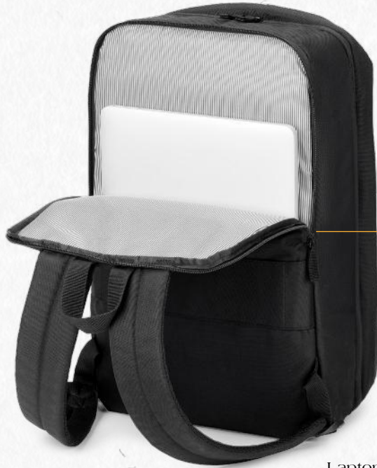
Laptop Compartment (Fits up to 15" laptop)