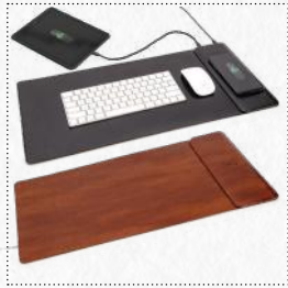
FABRIZIO T145 Keyboard Mat /Charging Station