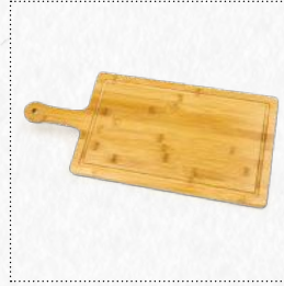
BAMBOO EC137 Charcuterie Board