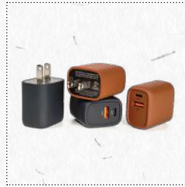
FABRIZIO T905 20W Fast Charge Wall Adapter (UL Certified)