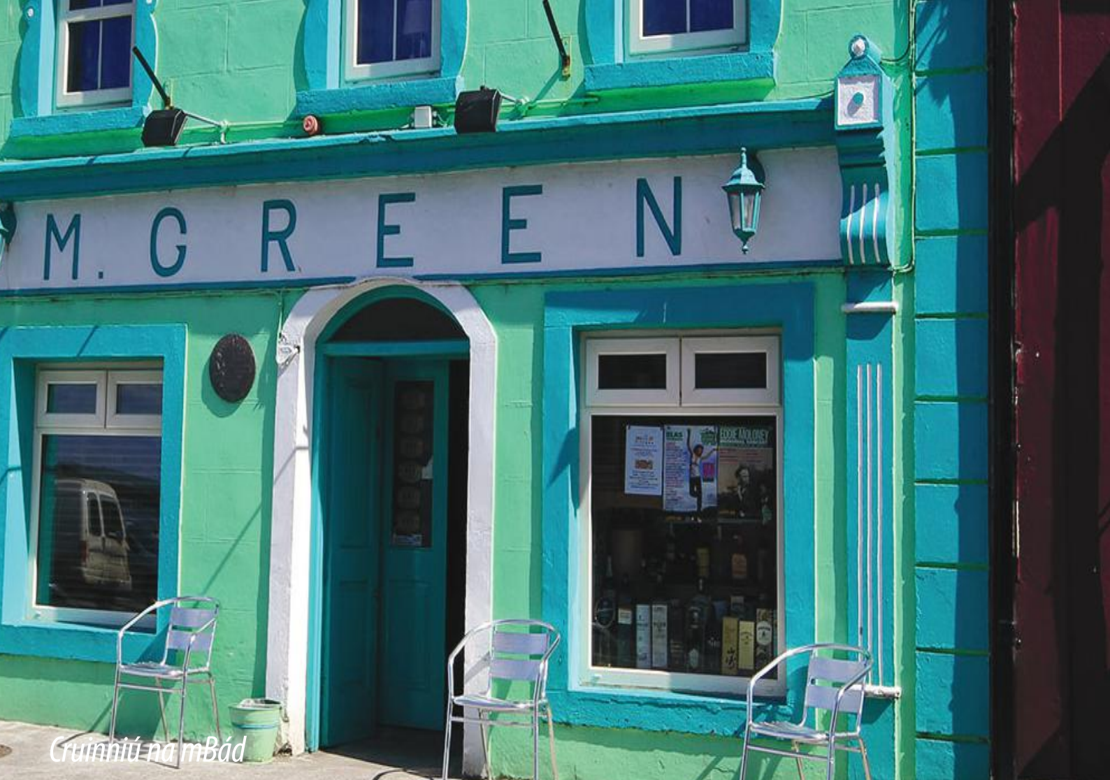
Cruinnítí na mBád