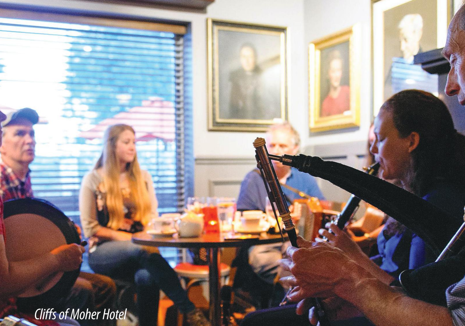
Cliffs of Moher Hotel