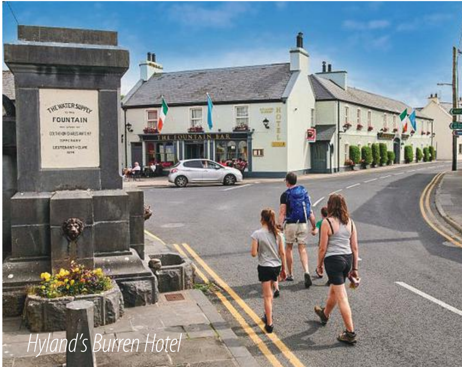
Hyland's Burren Hotel