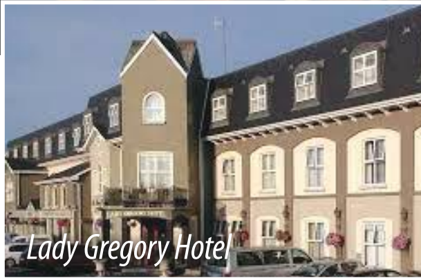
Lady Gregory Hotel