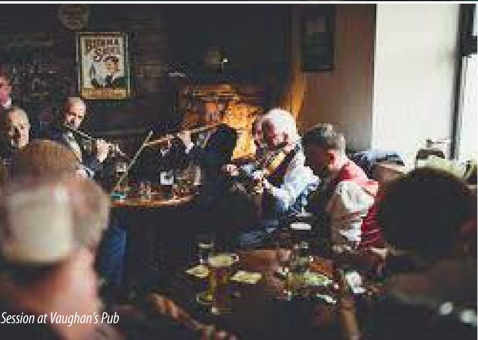
Session at Vaughan's Pub