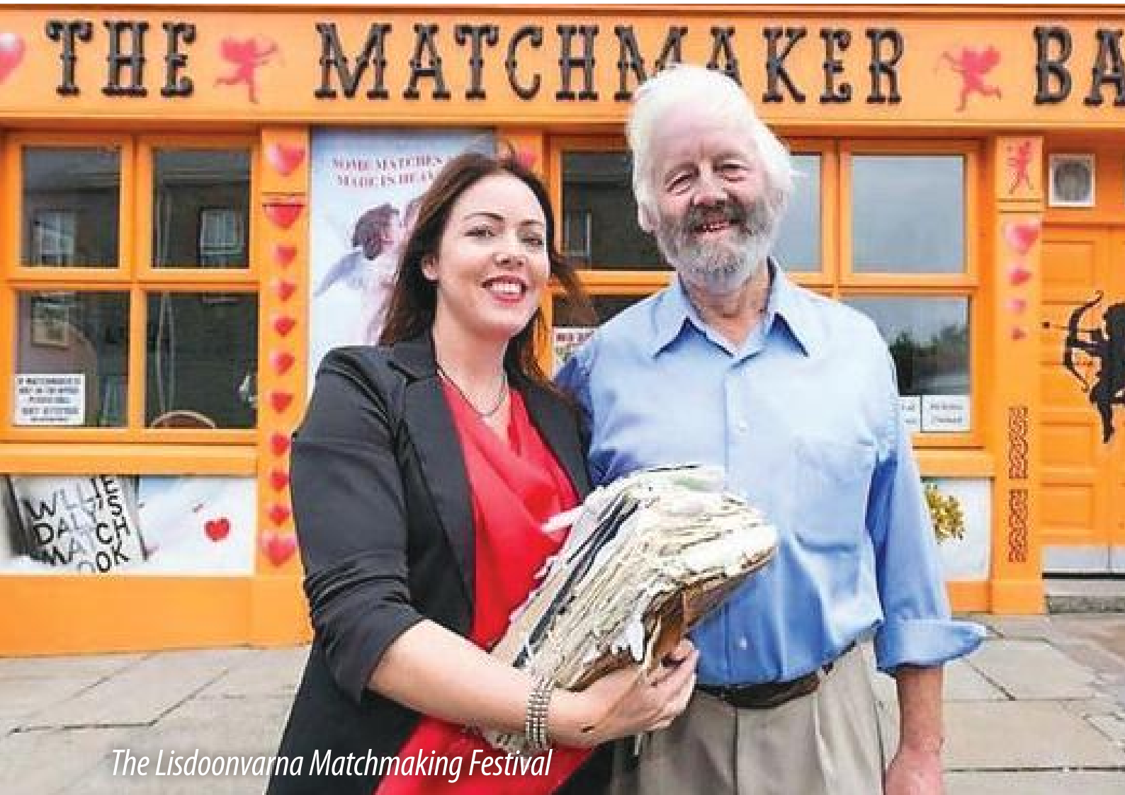
The Lisdoonvarna Matchmaking Festival