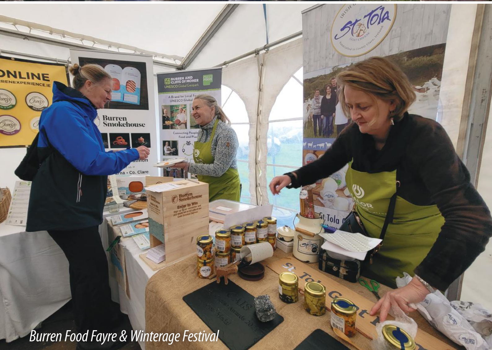
Burren Food Fayre & Winterage Festival