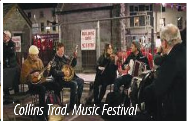
Collins Trad. Music Festival