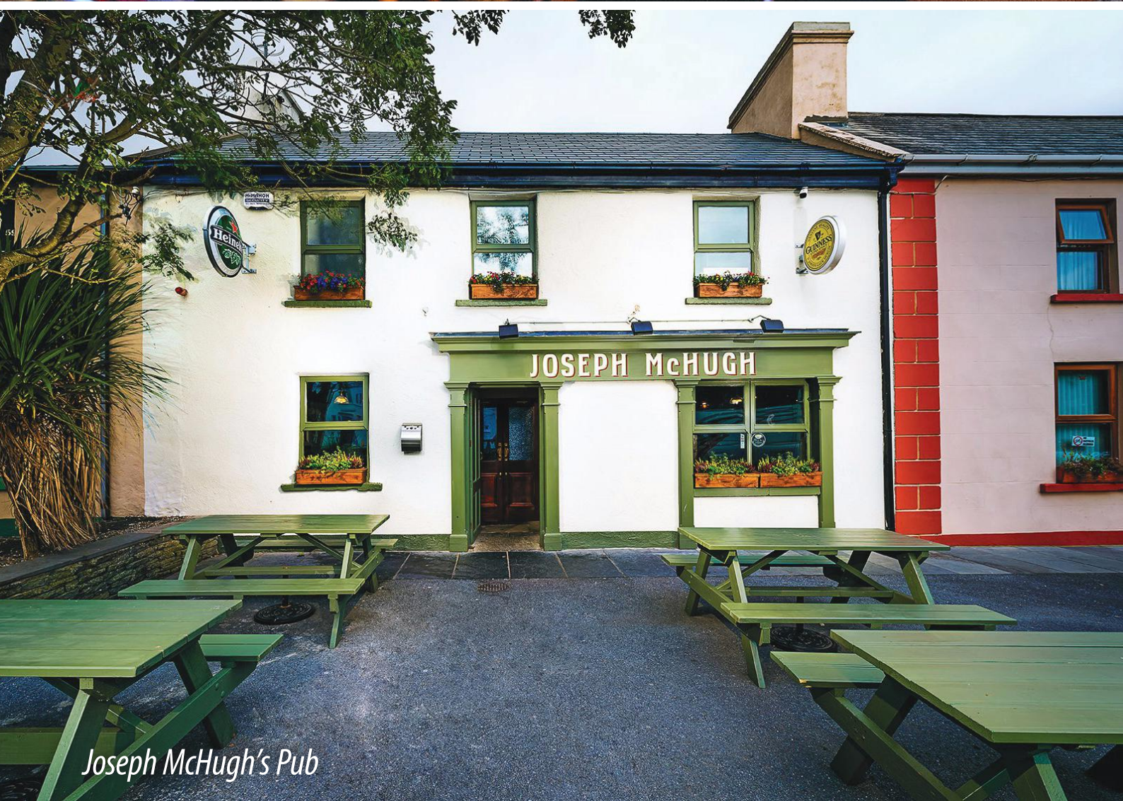
Joseph McHugh's Pub