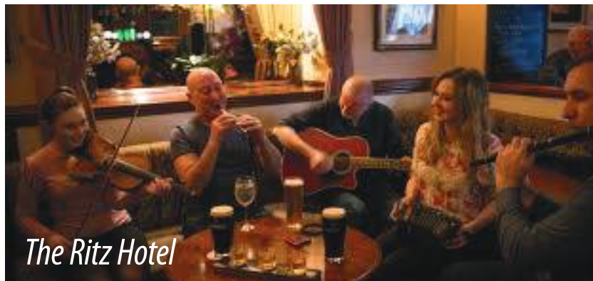
The Ritz Hotel

For more information go to: www.matchmakerireland.com