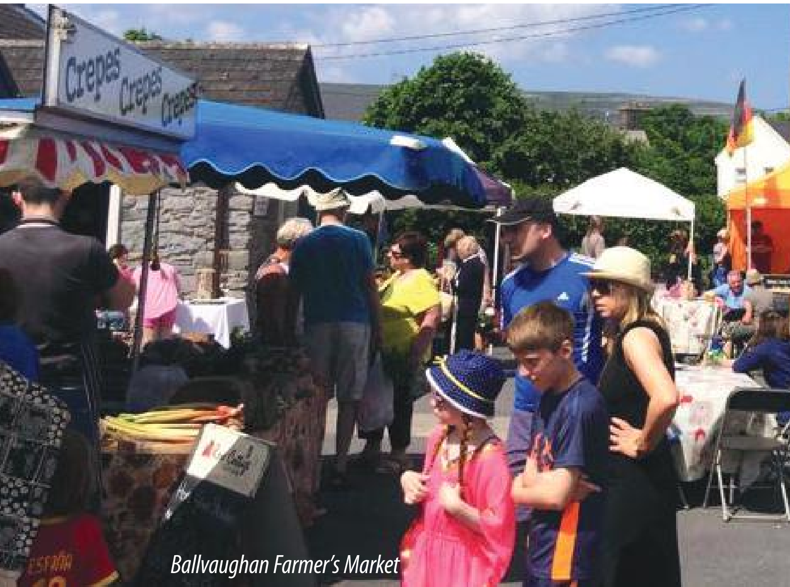
Ballyvaughan Farmer's Market

While you enjoy fresh local farm produce, listen to traditional and folk music. A focal point of the Ballyvaughan market every Saturday from April to October, 10am to 2pm, More information: www.facebook.com/BallyvaughanFarmersMarket/