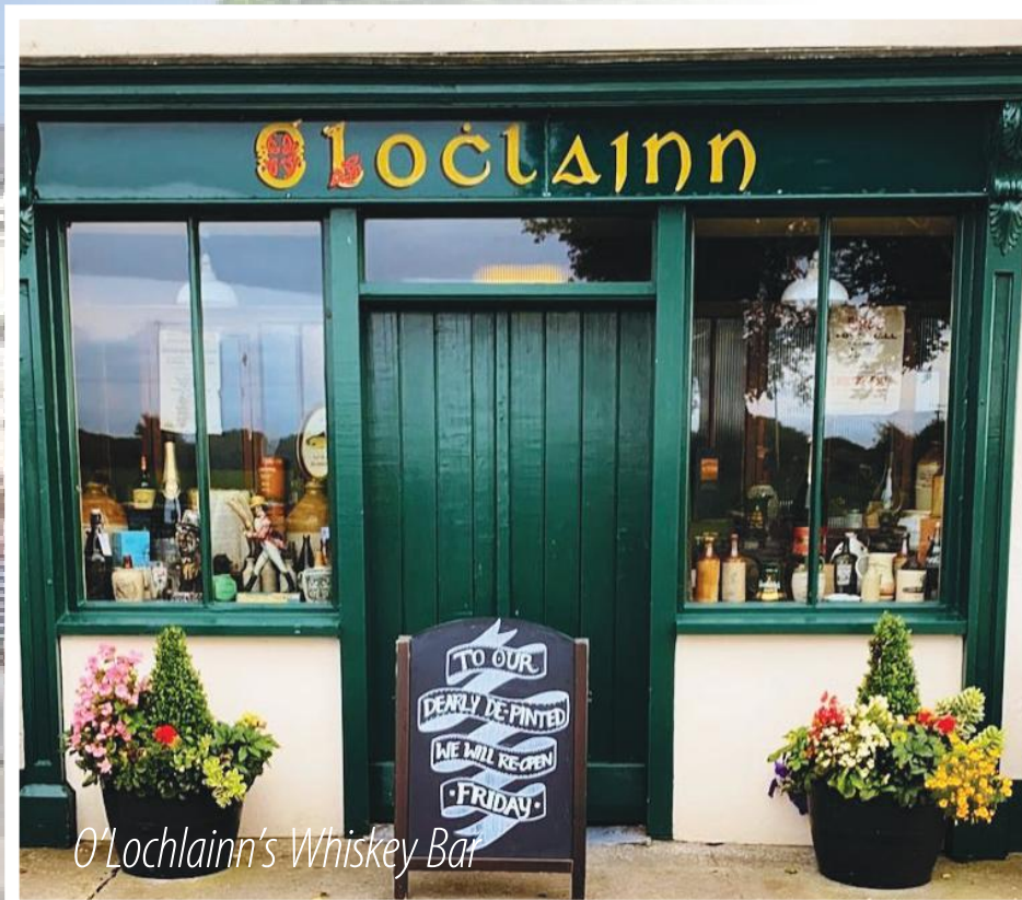
O'Lochlainn's Whiskey Bar