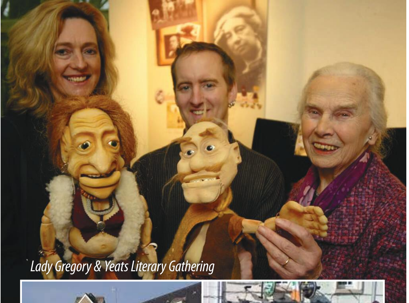
Lady Gregory & Yeats Literary Gathering