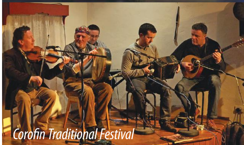
Corofin Traditional Festival