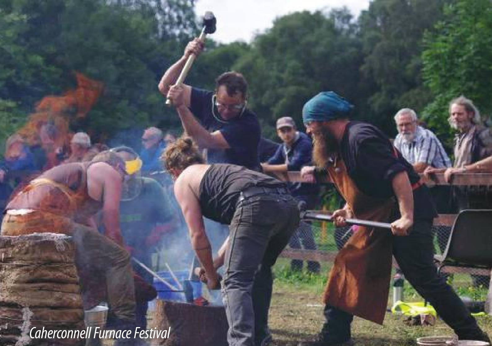
Caherconnell Furnace Festival