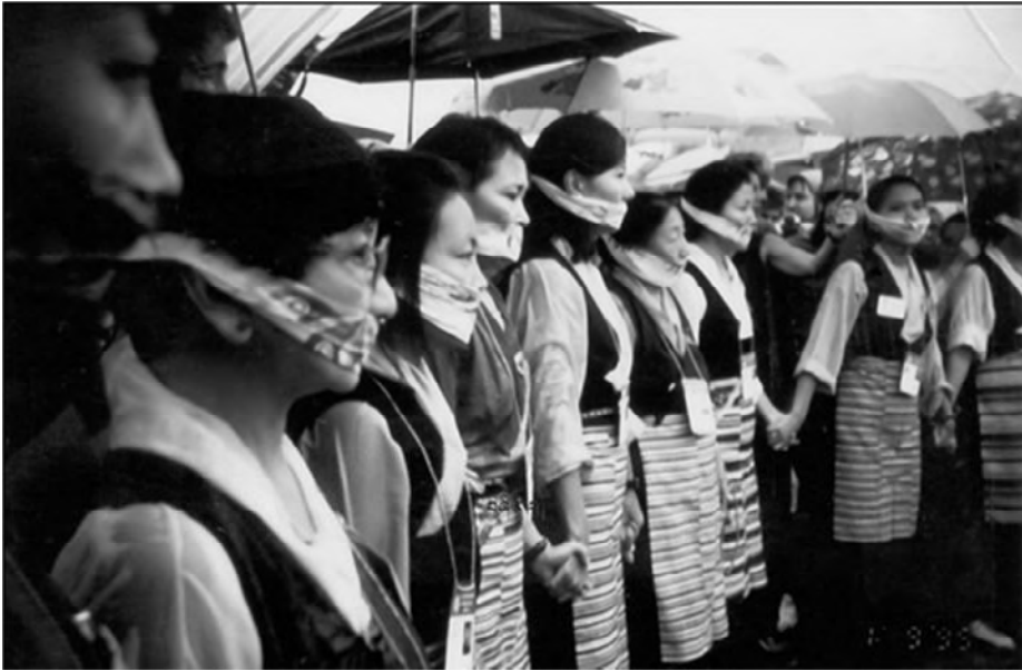
Picture 2: Tibetan Women's Protest at the United Nation's Fourth World Conference on Women, Beijing 1995

In 1995, nine women from The Tibetan Women's Delegation at the United Nation's Fourth World Conference on Women in Beijing staged a political protest at the event condemning the sterilization and torture of Tibetan women in Tibet. TWA had partnered with seven other Tibet NGOs in training nine women to participate in the conference in Beijing. Among the nine included women who were members of the TWA (TWA n.d. b). The protest caught the attention of the international media. The Tibetan leadership and diaspora at large applauded the women for being courageous in their protest and were celebrated as exemplary leaders. Soon after the success of the Beijing campaign, TWA began implementing leadership training for Tibetan women—a theme that had been stressed at the UN Women's Conference in Beijing. The leadership trainings TWA gave involved "introducing and developing the concept of the 'empowerment' of women" (Butler 2007, 4). Empowerment, in this scenario, involved "education" (76). The emphasis on educational pathways for women's empowerment aligned with the CTA's desires for leaders, which also emphasized the importance of education. During the initial construction of the refugee community in exile, the Tibetan apparatus spent a large portion of its efforts in developing schools both as a place to sustain life and to educate children in order to ensure a future generation that would lead the exile Tibetan community and its message. As