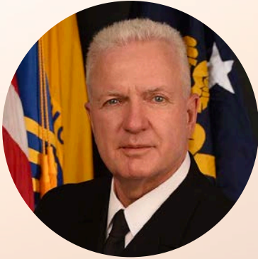
Brett Giroir, MD

Former Assistant Secretary for Health & Admiral US Public Health Service Commissioned Corps