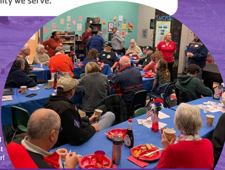
There were many cups of coffee enjoyed at the Leaders Club-hosted Veteran's Day breakfast in November!

We work to provide kids, families, and communities with the resources and opportunities they need to learn, grow, and thrive. That's why we offer a range of programs and services to meet the unique needs of each community we serve.