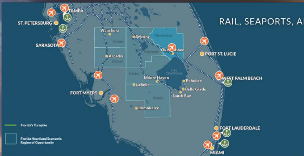
RAIL, SEAPORTS, AND AIRPORTS

Okeechobee County is perfectly positioned within one of the most dynamic areas for growth in the United States. In less than 125 miles, you will find countless airports and seaports, including: