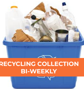
RECYCLING COLLECTION BI-WEEKLY