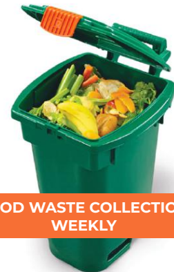
FOOD WASTE COLLECTION WEEKLY

Garbage, recycling, kitchen scraps, yard waste... the Town plays a central role in how local households manage waste. Public consultation and conversations with community members inspired us to work towards a more convenient, accessible, and sustainable Curbside Collection Service. We are proud to announce the new service will be starting in June!