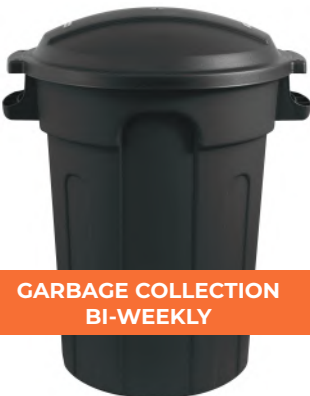
GARBAGE COLLECTION BI-WEEKLY