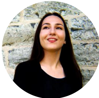
Daria Schibitcaia Violin