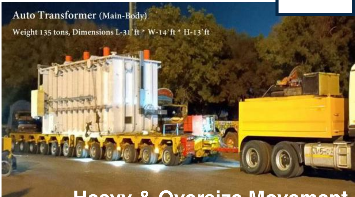
Auto Transformer (Main-Body)

Weight 135 tons, Dimensions L-31' ft * W-14' ft * H-13' ft