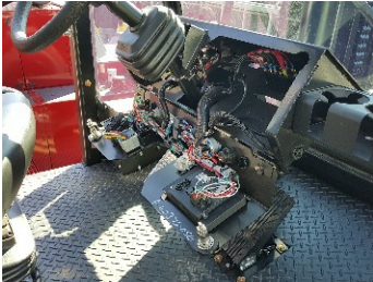
Flip-down Dash with Color/Number Coded Wiring (Standard)

Taylor Container Handlers are designed with ease of maintenance and serviceability as a key priority. With today's engine and emissions requirements, daily maintenance checks and timely periodic service are the key to your equipment's longevity. All daily checks across the Taylor product line can be accessed from either the ground or running board, ensuring that operators can complete these requirements with ease. Also, the side service doors and removable deck panels open to expose the drivetrain and hydraulics to provide easy access for service and inspection.