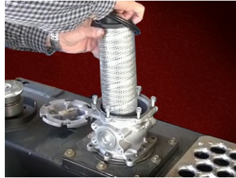
Spin-on Breather, Wire Mesh Strainer & Replaceable Internal Element (Standard)