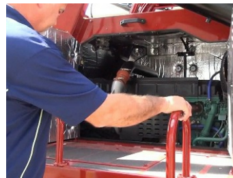
Service & Inspections from Running Board Dual Engine Bay Doors provide full access