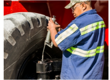
Easy Access for Steer Axle Maintenance