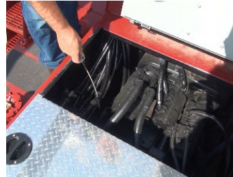
Easy Access to Drivetrain & Hydraulics