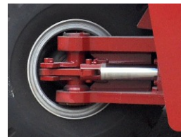
Industry's Toughest Steer Axle (Standard)