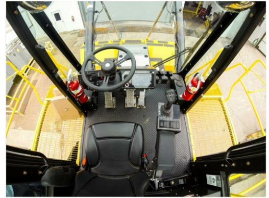
Fully Enclosed 2-door Cab - All Steel - 32,000 BTU Heater (Standard)