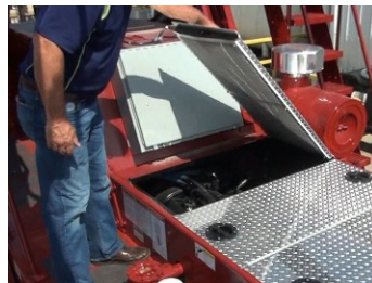
Lightweight Deck Lids and Easy Access to Heavy Duty Circuit Breaker Panel