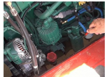
Easily Accessible Daily Checks