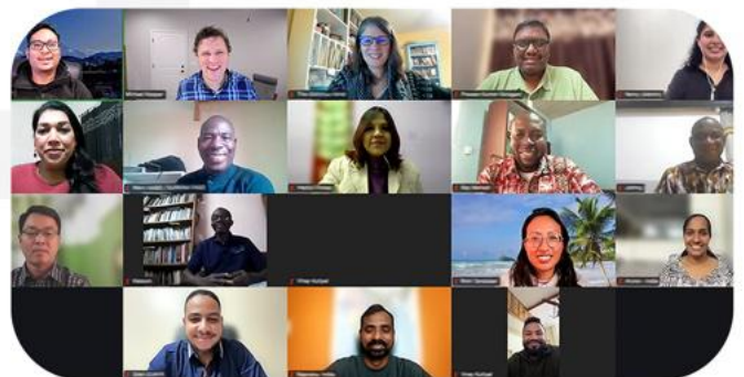
Virtual Coaching Graduation

Equipping leaders globally and locally is a two-way learning process: Insights from Lausanne help shape regional strategy, while experiences from local networks inform global practices. It's a cycle of learning, equipping, and multiplying - one that we hope will support stronger, healthier networks and meaningful impact for years to come.