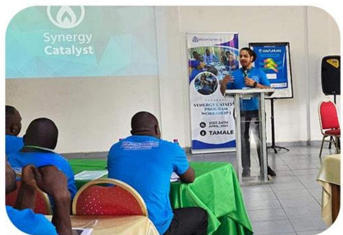
Synergy Catalyst Program in Ghana