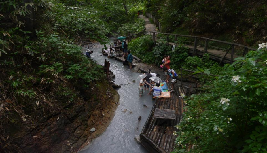
Relaxing in the free footbath at Oyunuma in Noboribetsu

One of the best hot spring towns in Hokkaido, if not Japan. Noboribetsu is an excellent choice for budget travelers who want to enjoy a Japanese hot spring, or at least see the interesting volcanic activity that creates such experiences. The town is well set up for tourists, with an excellent choice of free things to do, such as plenty of walking routes and a footbath.