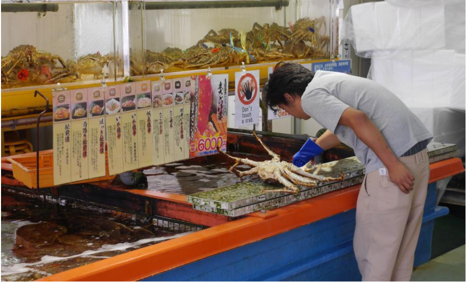
Preparing fresh crab for a morning meal at the Hakodate Morning Market