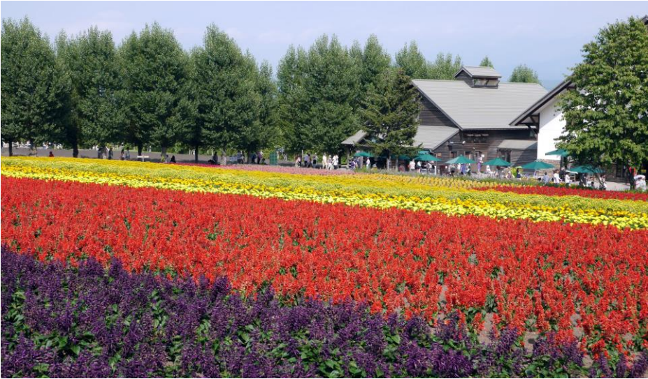
The beautiful flower fields of Furano in central Hokkaido

Welcome to Hokkaido, Japan's northern island, just waiting to be discovered by the masses. It's a quieter, more spacious and most importantly cheaper place to visit than the rest of Japan, and is full of unspoiled mountains to hike, hot springs to relax in and plenty of local delicacies to enjoy. From historical cities such as Hakodate, to huge ski resorts such as Niseko, to the beautiful flower fields of Furano, Hokkaido really stands out from the rest of Japan. With this guide, you'll find out how to really enjoy it on a reasonable budget.