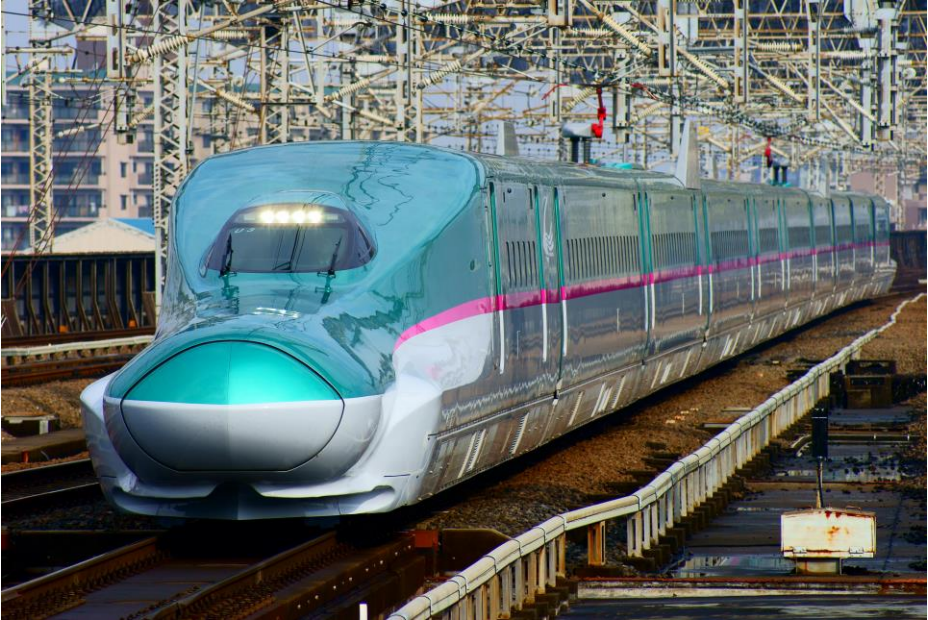
The super fast new Hayabusa Shinkansen trains bring tourists to Hokkaido all the way from Tokyo