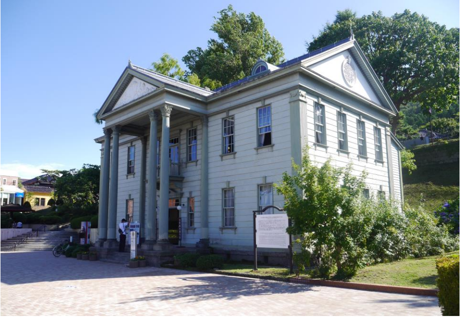
One of the traditional western-style buildings in Motomachi

One of the first cities in Japan to open up to international trade, Hakodate offers visitors something different from the rest of Hokkaido. Dutch, American, English and other traders came and settled here when Japan opened up more than 150 years ago, creating a rich history and places to visit that feel like a fusion of east and west. Give yourself at least a day to enjoy it all and make sure you try the succulent seafood rice bowls at the morning market.