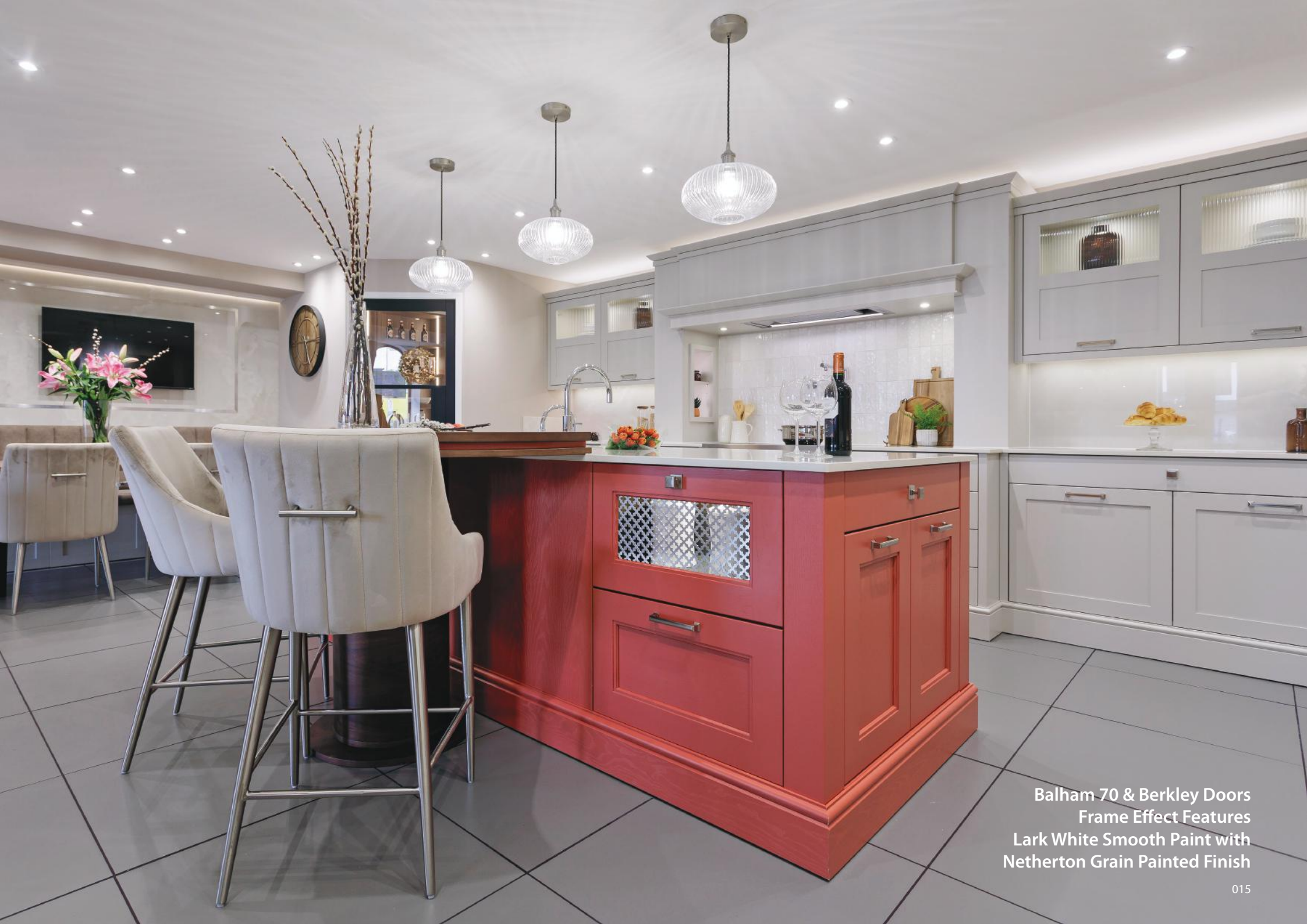
Balham 70 & Berkley Doors Frame Effect Features Lark White Smooth Paint with Netherton Grain Painted Finish