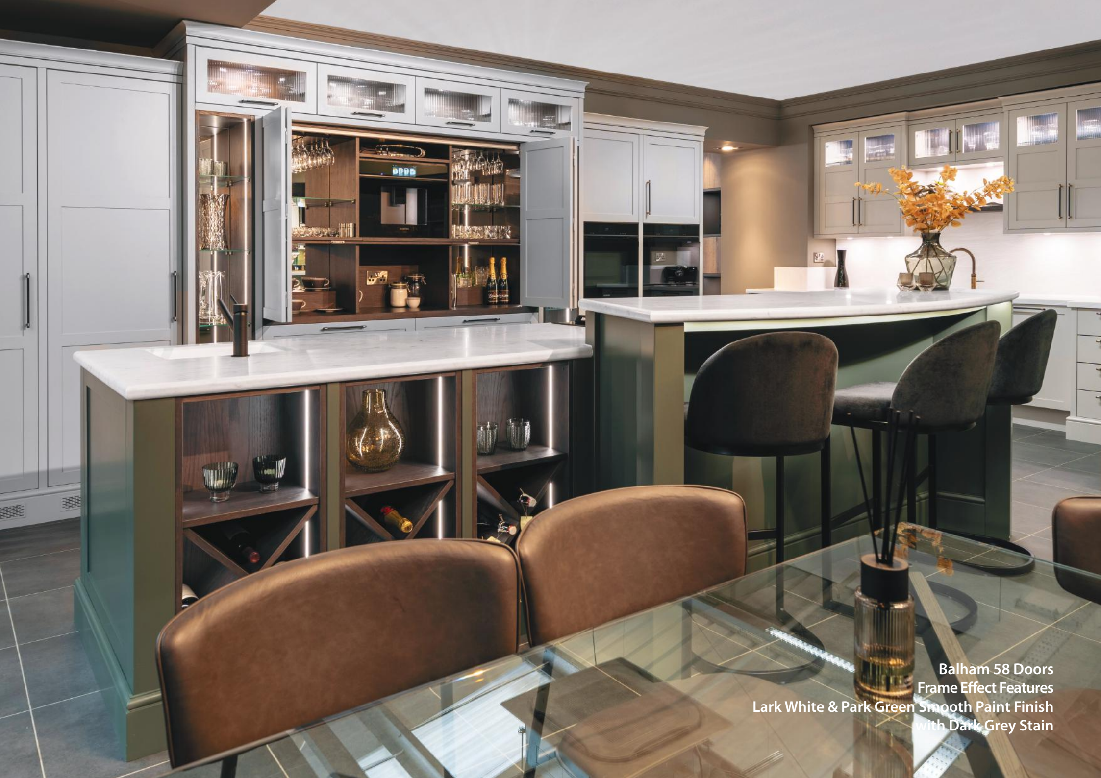
Balham 58 Doors Frame Effect Features Lark White & Park Green Smooth Paint Finish with Dark Grey Stain