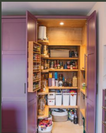
Kingston 70 Grande Deco Features Custom Grain Painted Finish