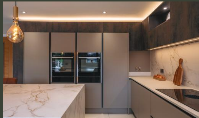
Orphic & Monza Doors Cubic Features Oxide Artstone & Matt Stone Grey