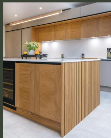
Chelsea Trio & Monza Doors Cubic Features Pure Oak & Matt Light Grey