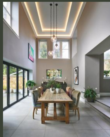
Balham 70 Doors Shaker Handleless Dried Lawn Smooth Paint Finish