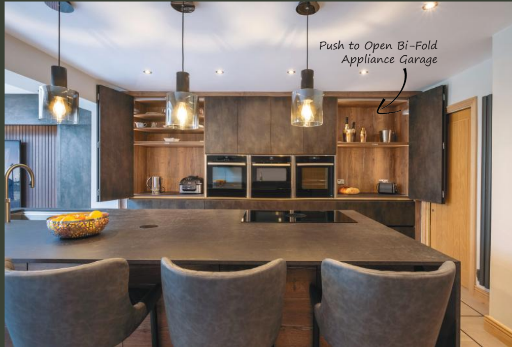
Push to Open Bi-Fold Appliance Garage