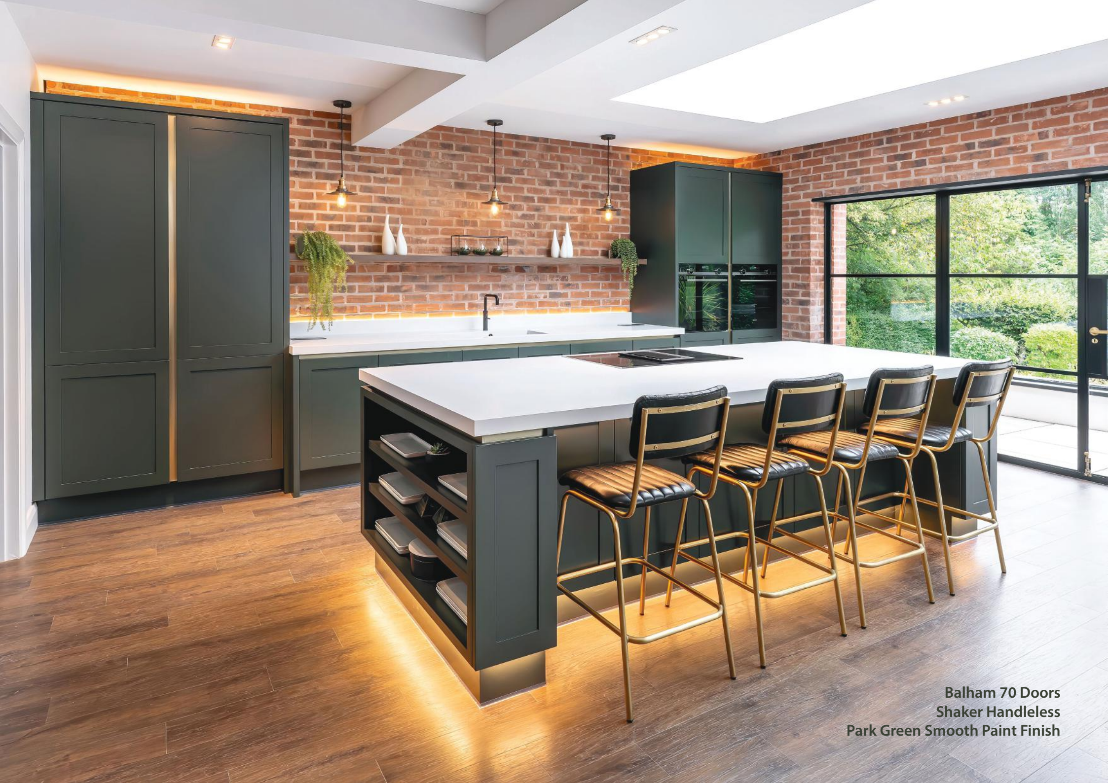
Balham 70 Doors Shaker Handleless Park Green Smooth Paint Finish