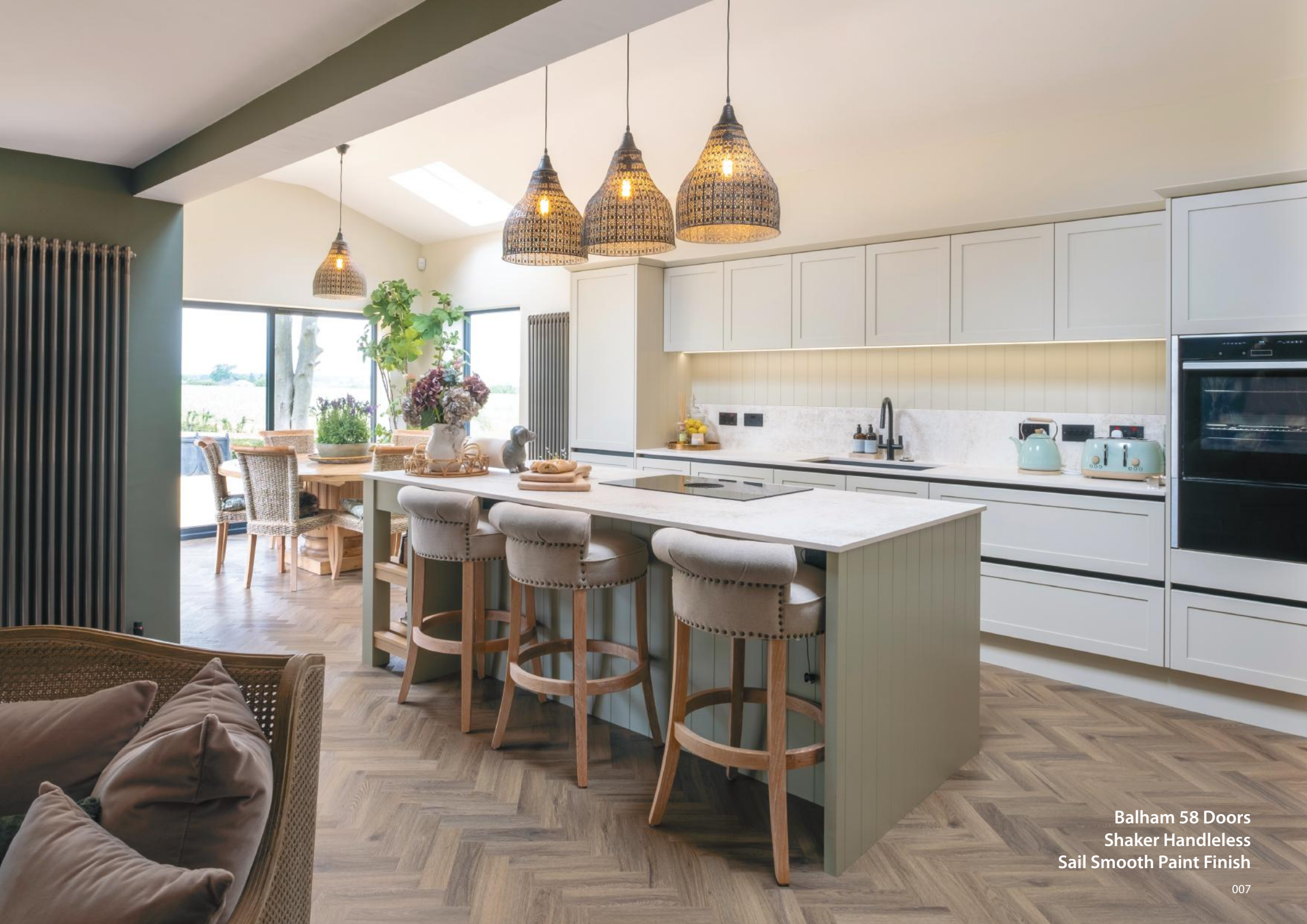
Balham 58 Doors Shaker Handleless Sail Smooth Paint Finish