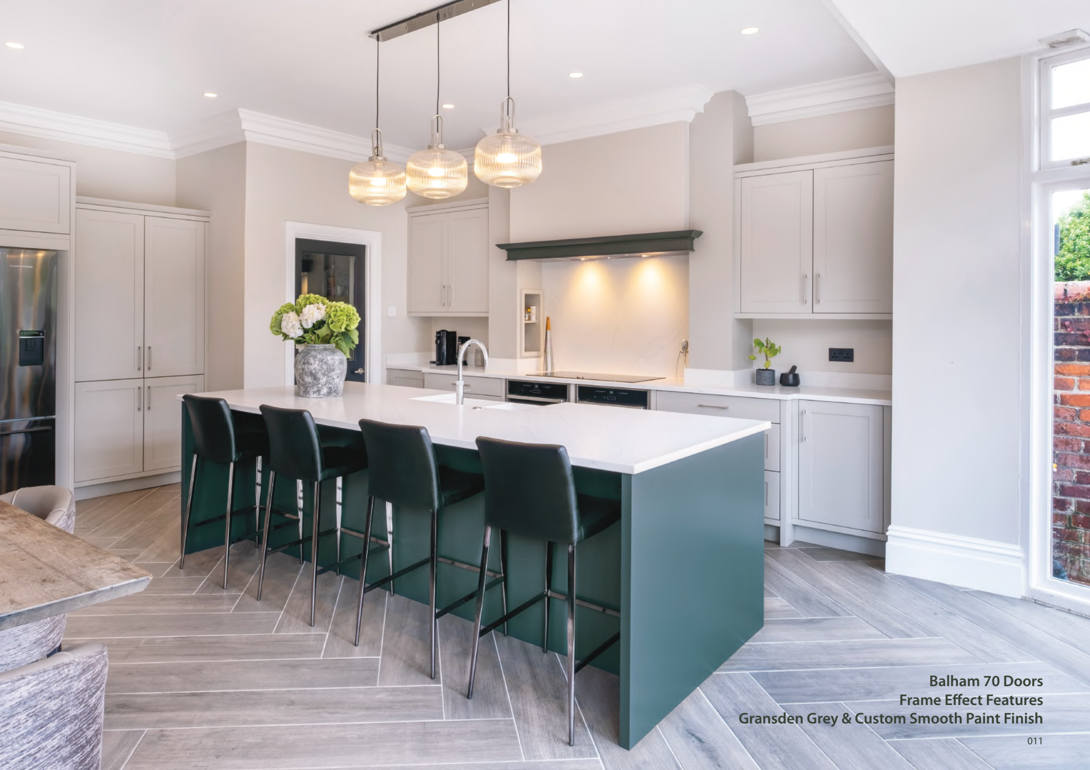
Balham 70 Doors Frame Effect Features Gransden Grey & Custom Smooth Paint Finish