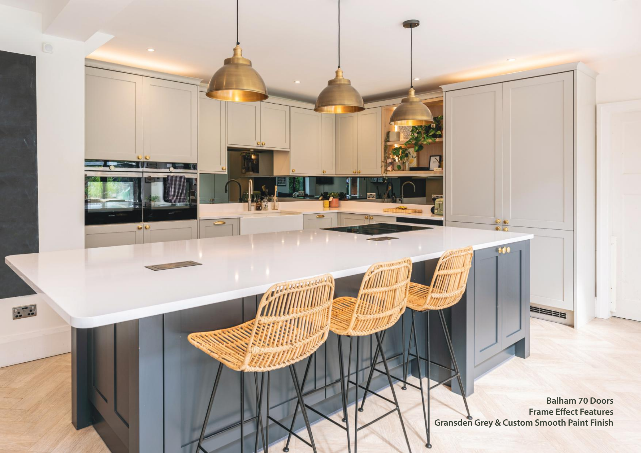
Balham 70 Doors Frame Effect Features Gransden Grey & Custom Smooth Paint Finish