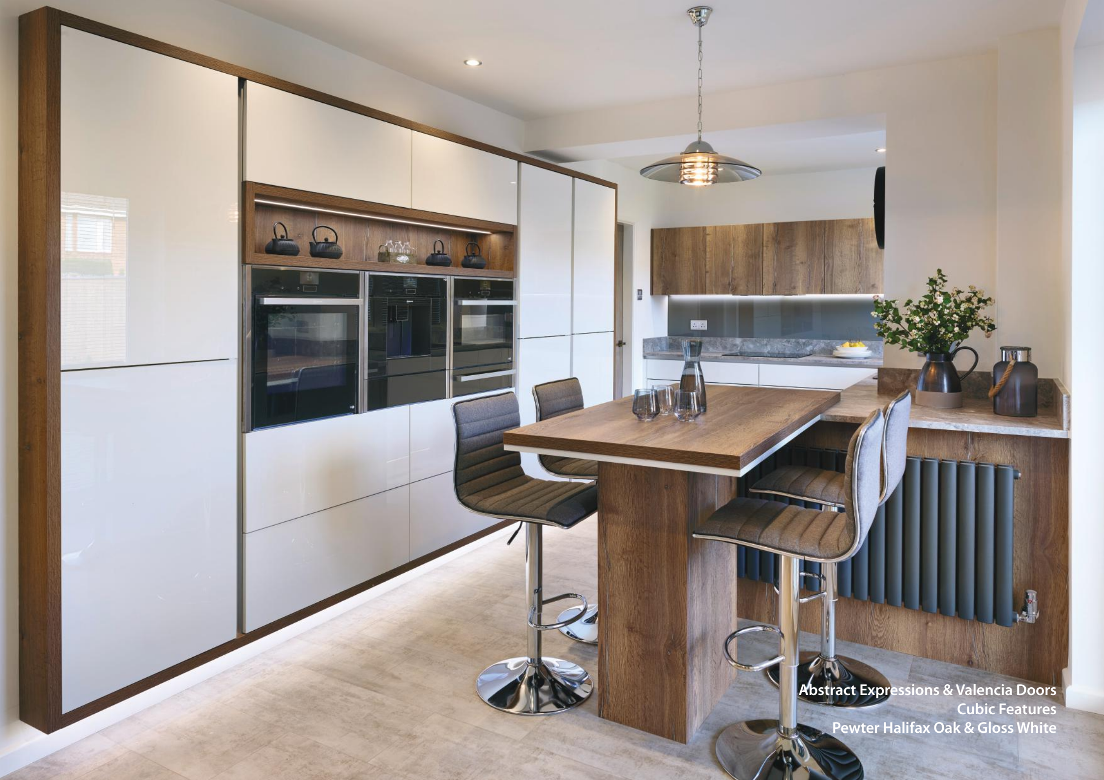
Abstract Expressions & Valencia Doors Cubic Features Pewter Halifax Oak & Gloss White