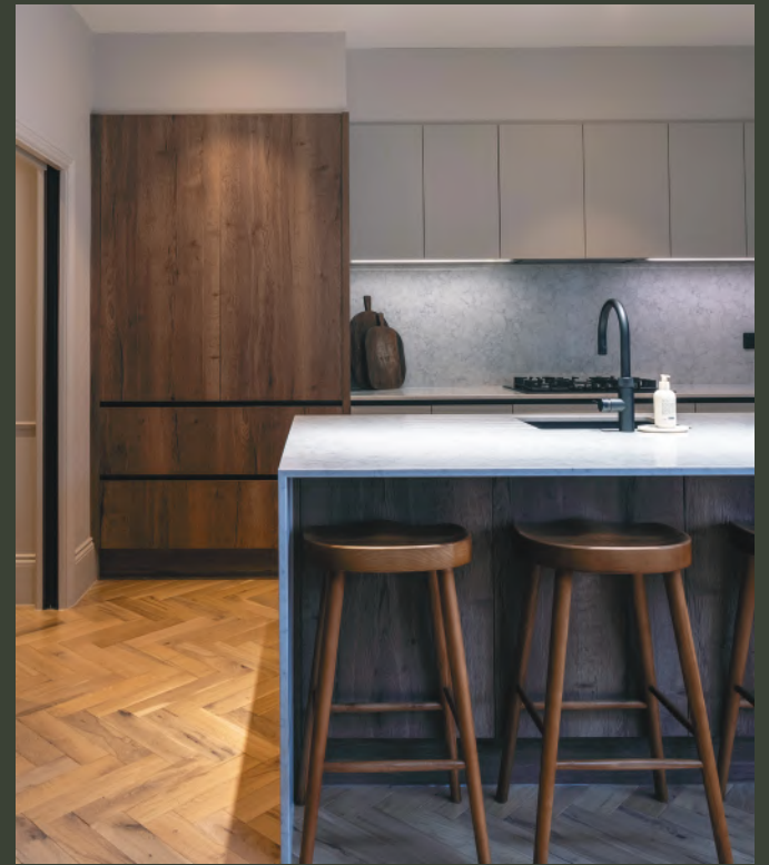
Abstract Expressions & Monza Doors Cubic Features Tobacco Halifax Oak & Matt Light Grey