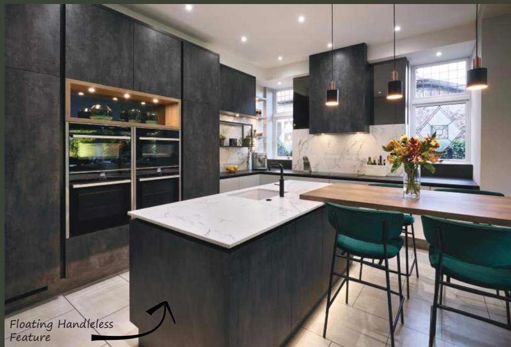
Floating Handleless Feature