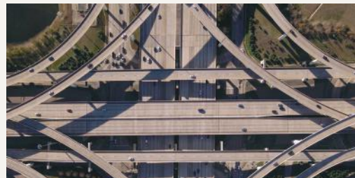
Intersection of Business and Government