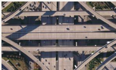
Intersection of Business and Government