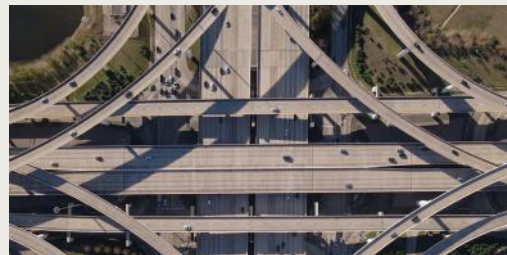
Intersection of Business and Government