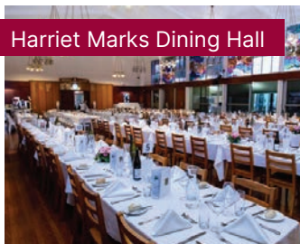
Harriet Marks Dining Hall