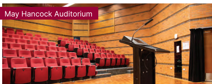
May Hancock Auditorium