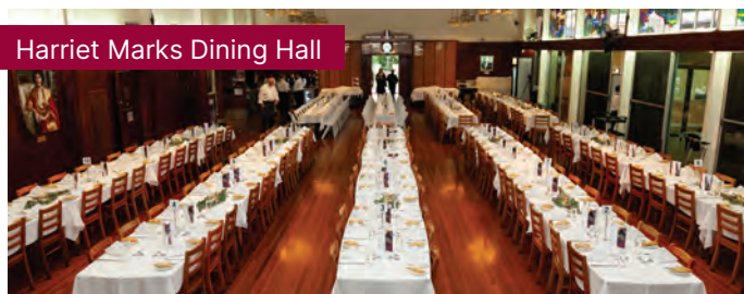
Harriet Marks Dining Hall