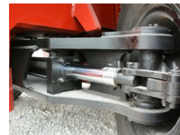
Industry's Toughest Steer Axle (Standard)