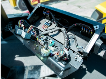
Flip-down Dash with Color/Number Coded Wiring (Standard)

Taylor Lift Trucks are designed with ease of maintenance and serviceability as a key priority. With today's engine and emissions requirements, daily maintenance checks and timely periodic service are the key to your equipment's longevity. All daily checks across the Taylor product line can be accessed from the ground or running board, ensuring that operators can complete these requirements with ease. Also, the gull-wing hood and side service doors open to expose the drive train and hydraulics to provide easy access for service and inspection.