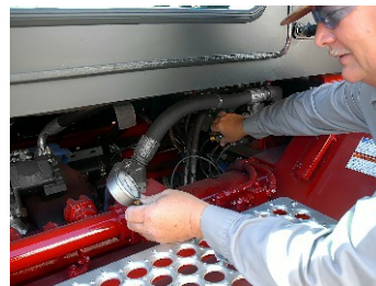
Service & Inspection from Ground Level