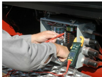
Heavy Duty Circuit Breakers/Reset Switches (Standard)