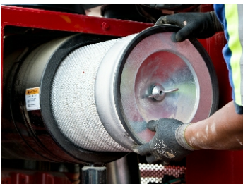
Donaldson Air Cleaner with Safety Element (Standard)