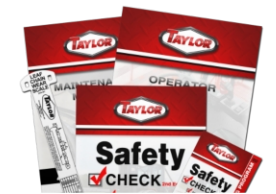
Vehicle Information Package (Standard)