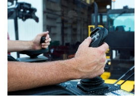
Mini-Wheel Steering & Joystick Control (Standard)