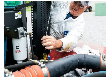
Easily Accessible Daily Checks