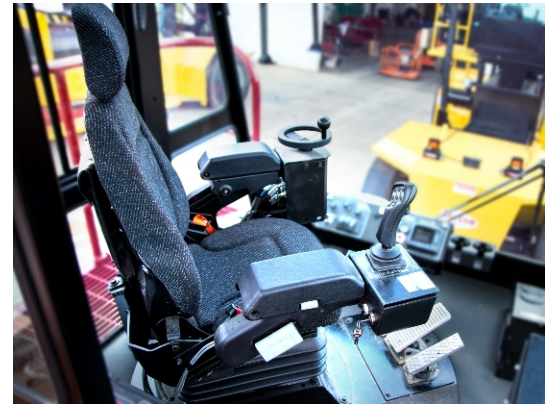
Fully Enclosed 2-door Cab - 180° Rotating Operator Platform (Standard)