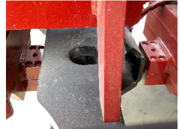
Steer Axle Pivots, 4 Bolt Mounting with Grease Fittings