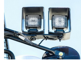
8 LED Work Lights (Standard)