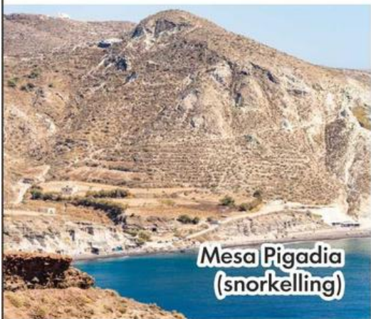
Mesa Pigadia (snorkelling)