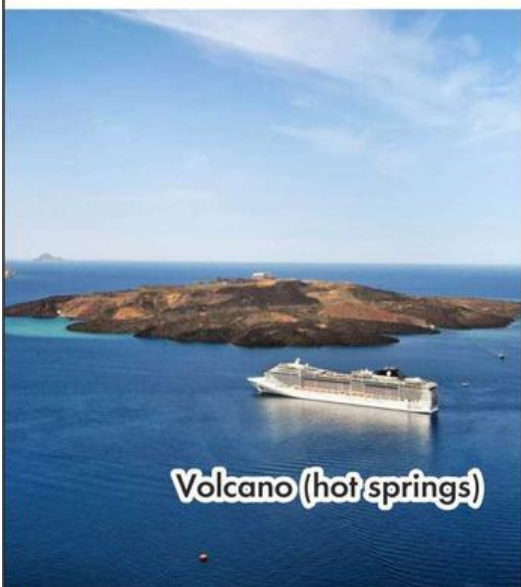
Volcano (hot springs)