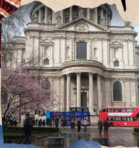
The British Museum