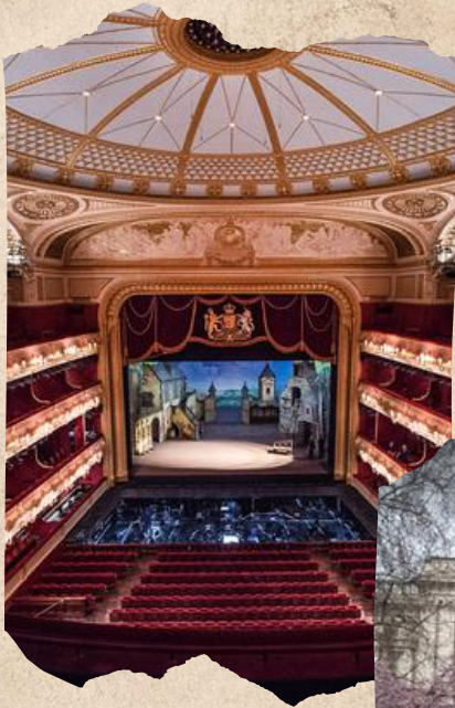
Royal Opera House