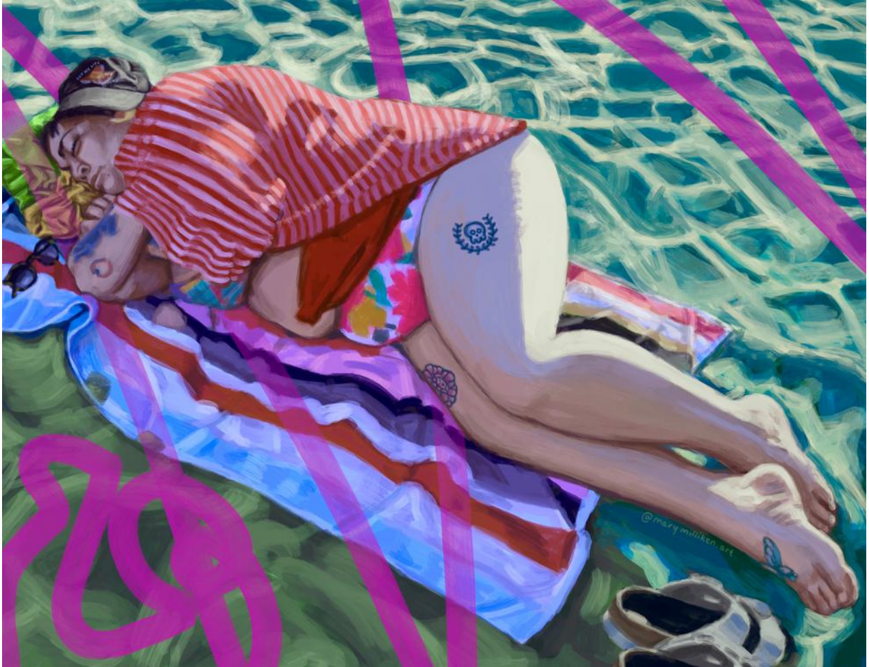
Mary Milliken Beach Nap Digital Painting Giclée Print 12 x 16 inches $225