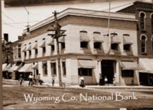
Wyoming Co. National Bank