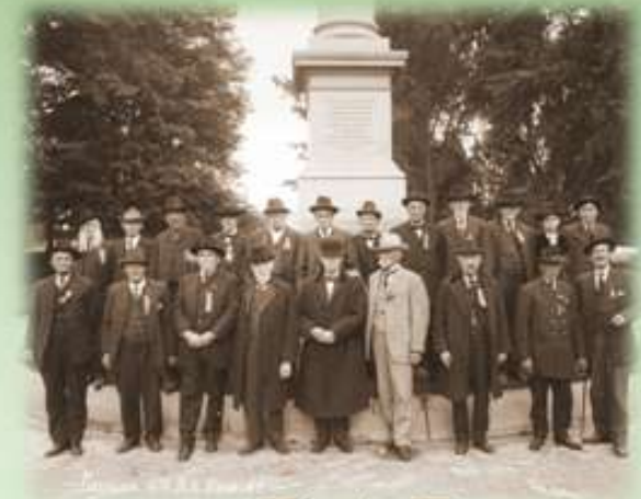
G A R

The GAR , the DAR and the Red Cross were also headquartered here.