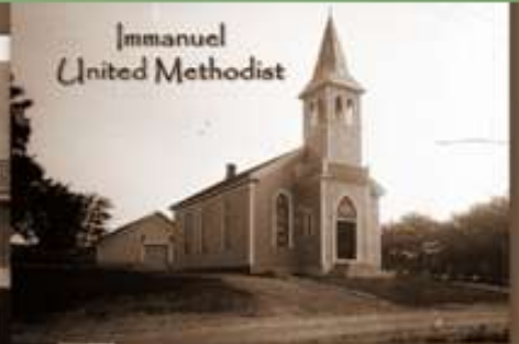
Immanuel United Methodist