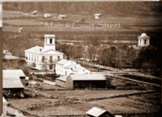
Main & Court Street