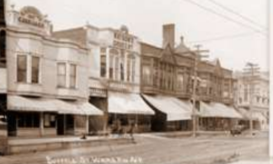
COTTAGE & WINDMILL