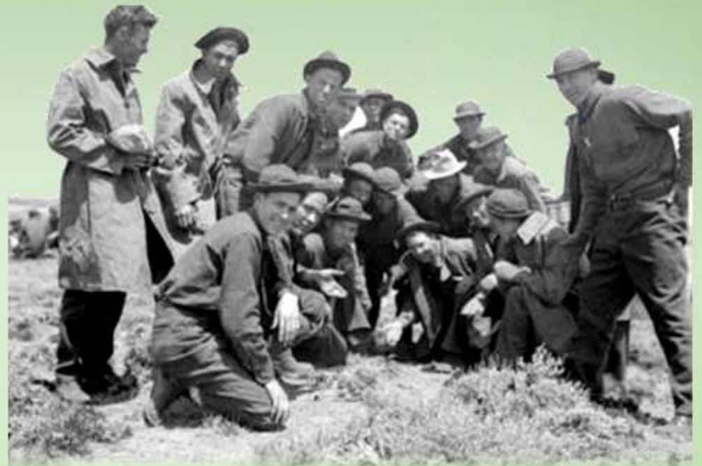
Civil Conservation Corps