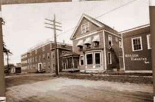
N. Side of Buffalo Street