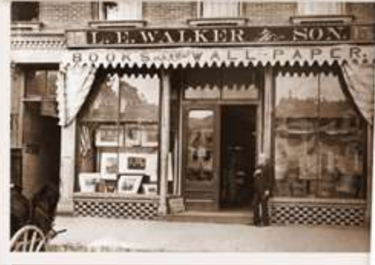
L. E. WALKER & SON BOOKS and WALL PAPER