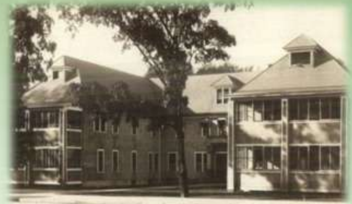
West Buffalo Street

Nurses in training at the Wyoming County Hospital also lived in the House.