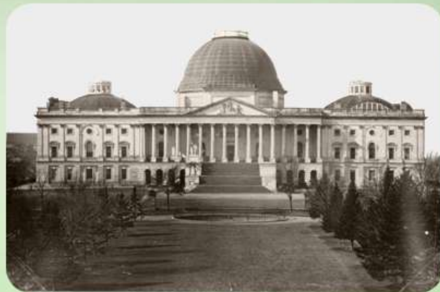
US Capitol - 1846

He was then one of only four abolitionists in Congress.