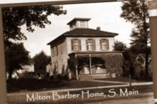
Milton Barber Home, S. Main