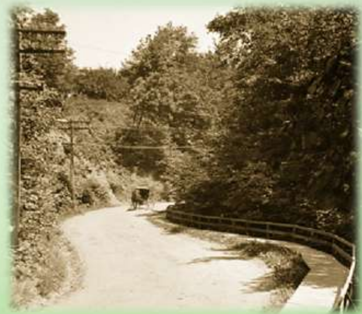
Gulf Road - Rte 20a

A comprehensive research library of rare maps, newspapers, thousands of photos and documents . . .