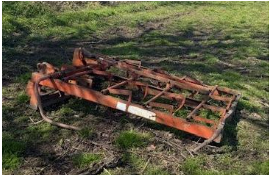
Brown Flat 8 Grab