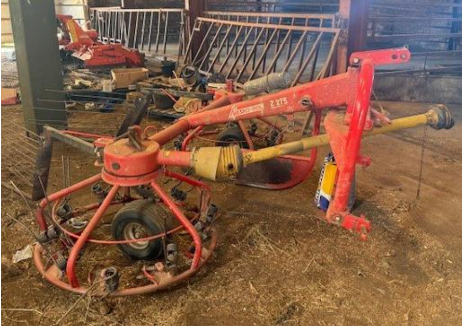
Mesko-Roi Z275 Hay Bob