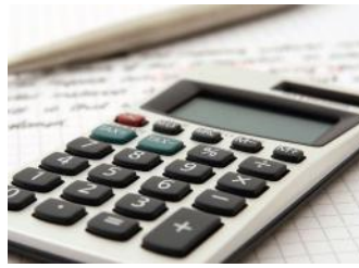
Land and Property Auctions