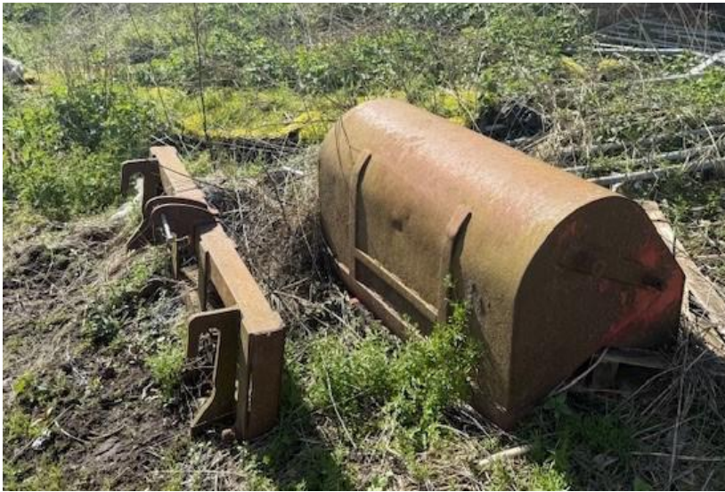
Muck Bucket / Bale Spike