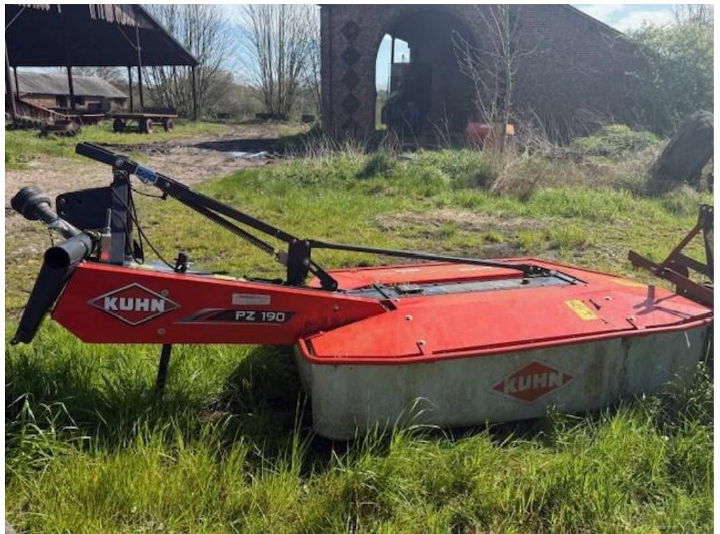
Kuhn PZ190 2 Drum Mower