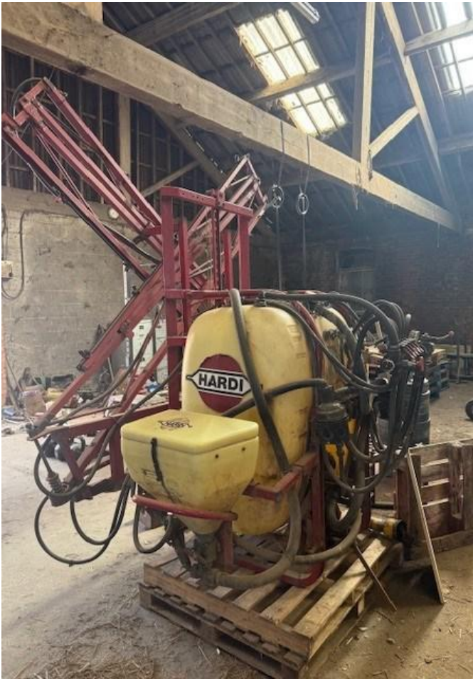
Hardi 600I Sprayer