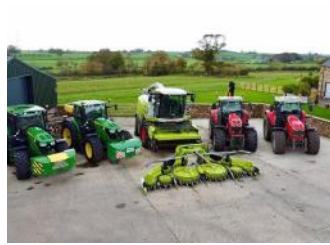
Farm Dispersal Sales