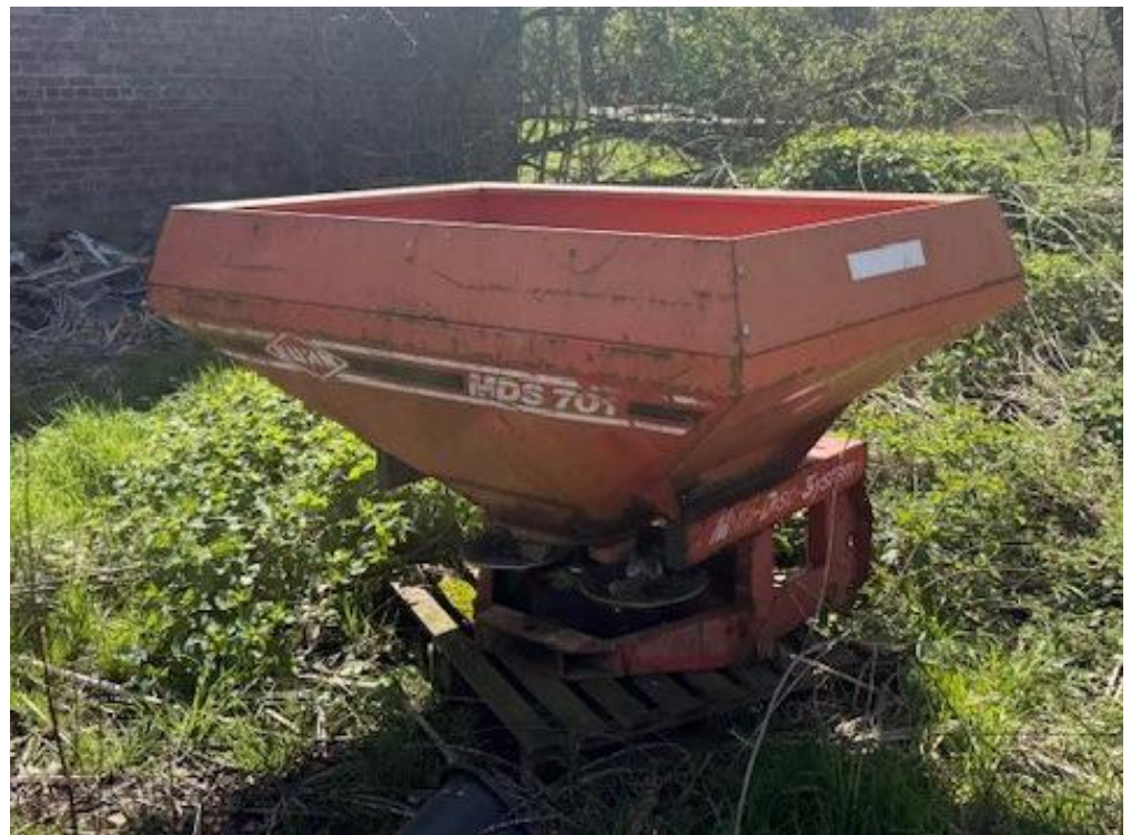
Kuhn MDS 701 Fert Spreader