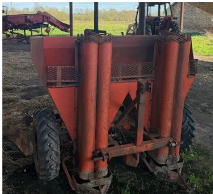
Reekie Potato Planter