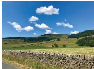
Land, Estate & Property Management