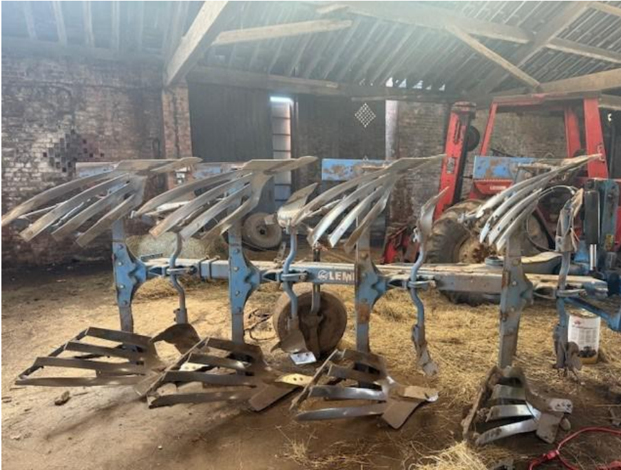
Lemken 4 Furrow Reversible Plough Slatted Mole Boards C/W Large Qty of Spares