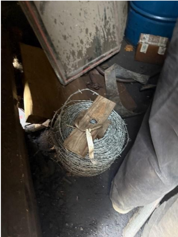
Miscellaneous Fencing Equipment