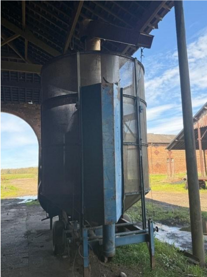
Master 9 T Ventacrop Diesel Fired Grain Dryer C / W Grain Cleaner