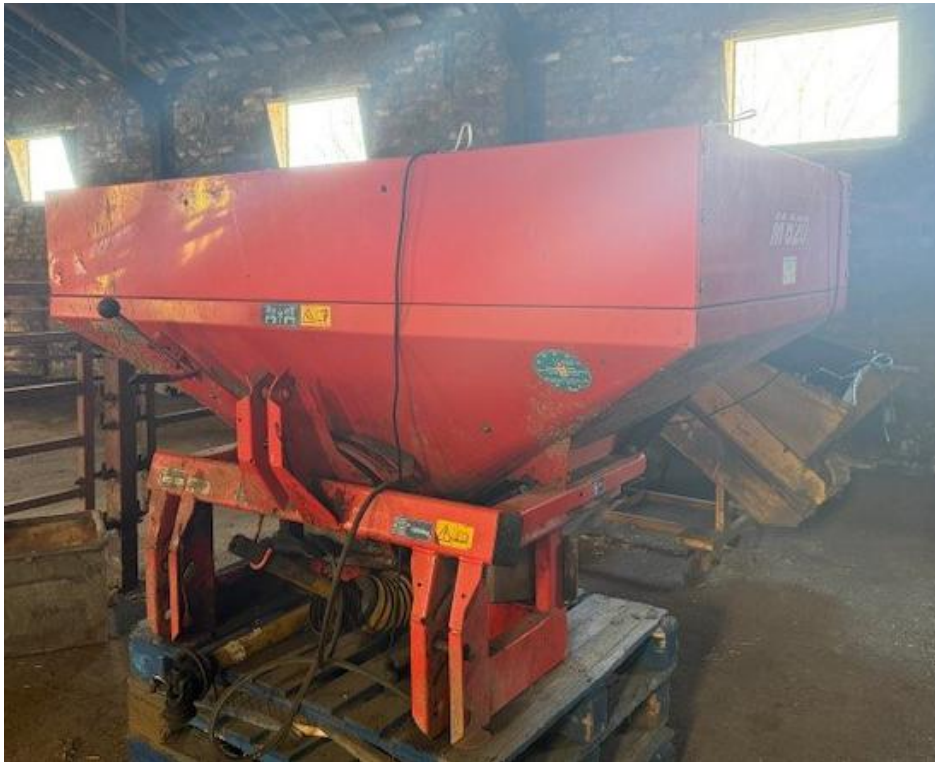
Kuhn MDS 735M Fert Spreader