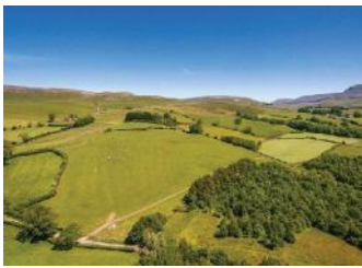
Rural Grants & Subsidies