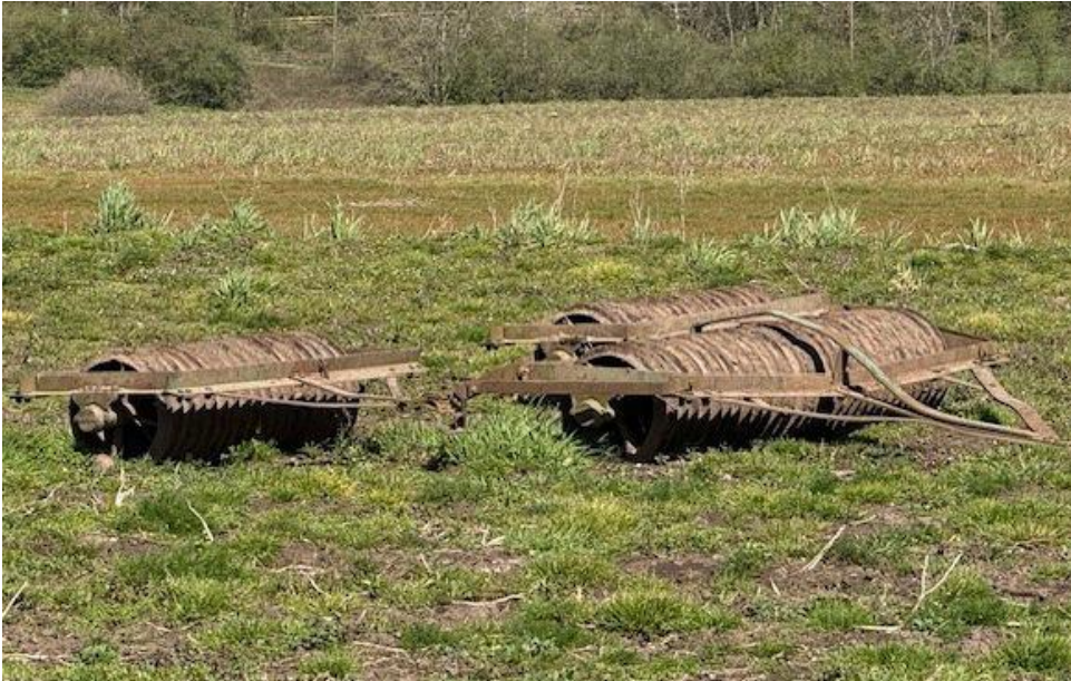
Gang Cambridge Rollers