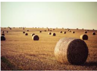
Rural Finance Advice