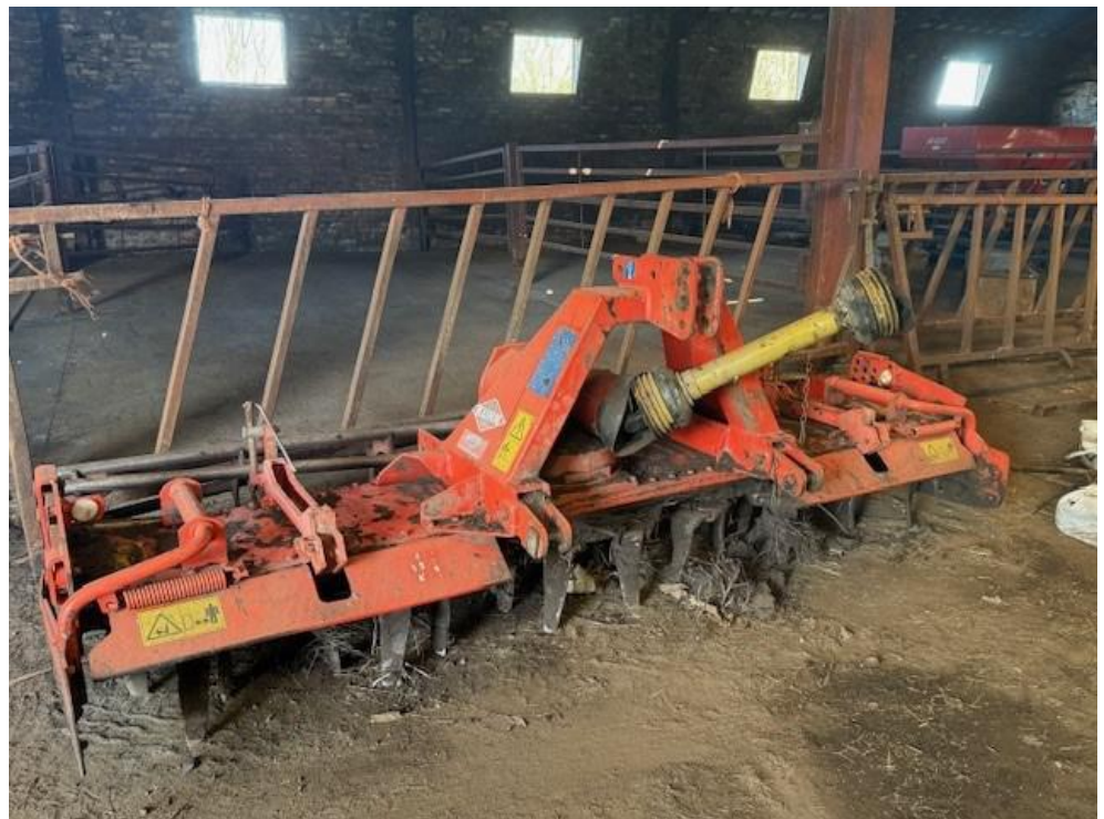
Kuhn HB300 Power Harrow Spring Tine Cultivator