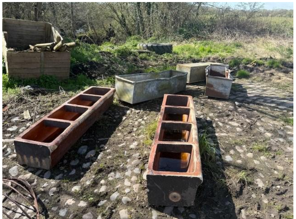
Salt Glazed Troughs