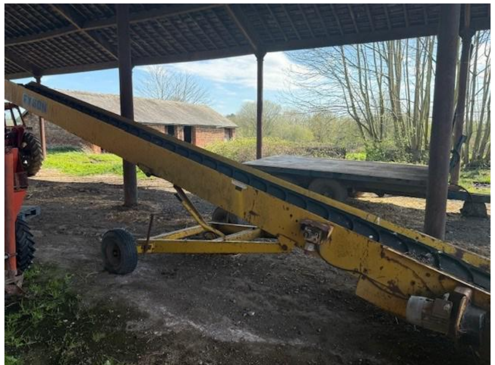
Fysor Potato Elevator