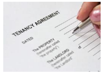
Rural Landlord & Tenant