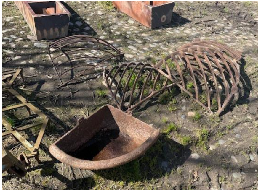
Qty of Bygones