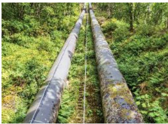
Utilities, Access to Land & Compulsory Purchase