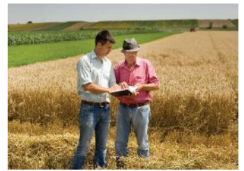
Rural Business Advice & Succession