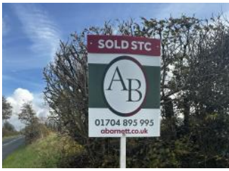
Sales & Purchases