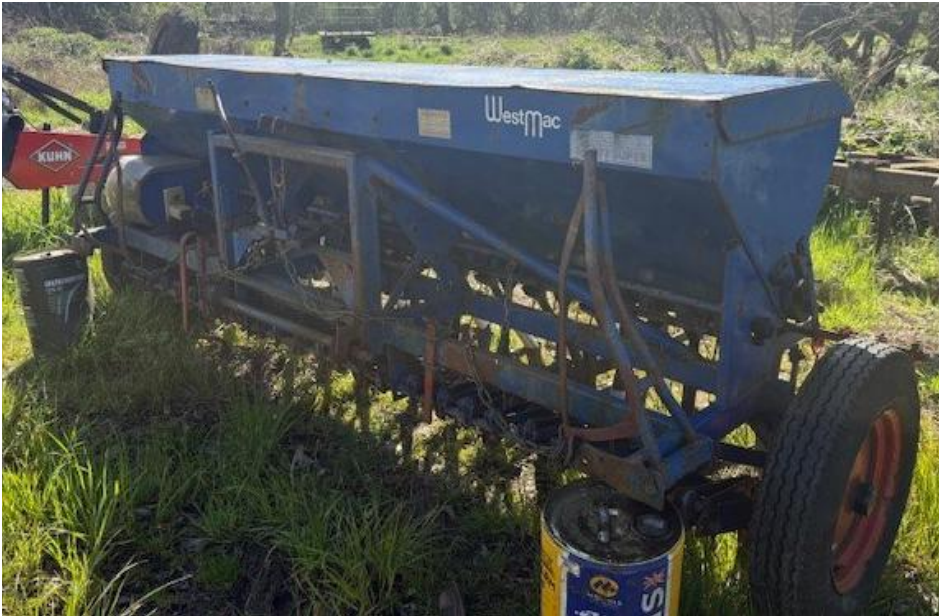
Fiona 3m Seed Drill