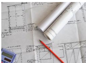
Planning Development, Option & Promotion