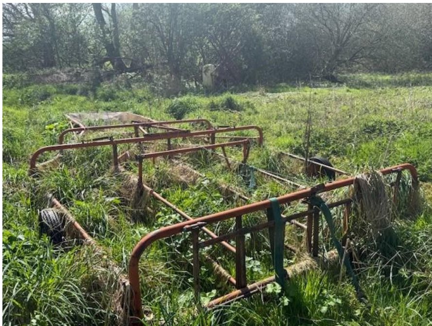
Browns Flat 8 Accumulator