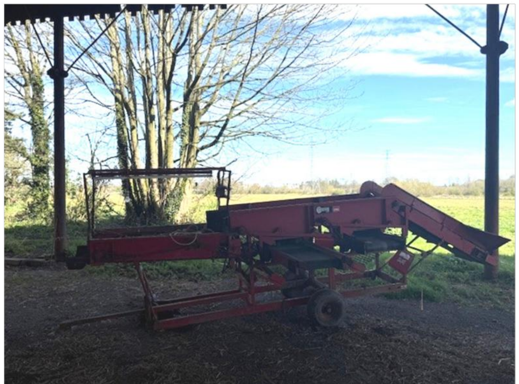
Small Potato Grader