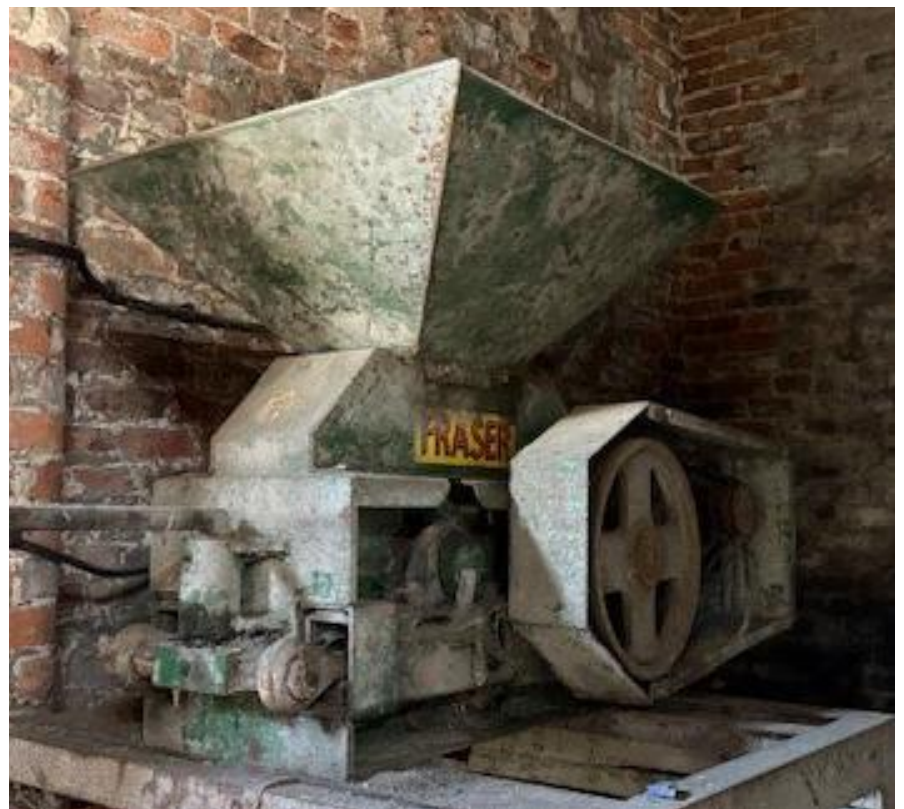
Fraser Hammer Mill