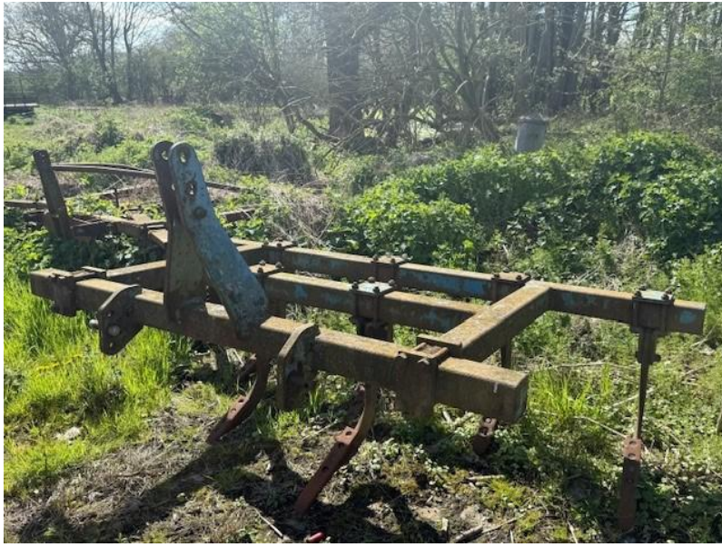
Heavy Duty Ransomes Ripper Cultivator