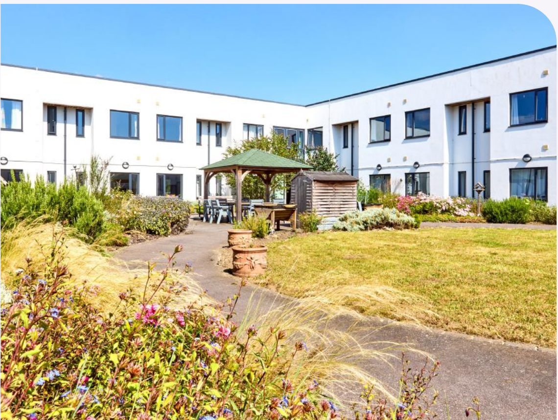
Pictures: Mountfield, High Haven, Mayflower