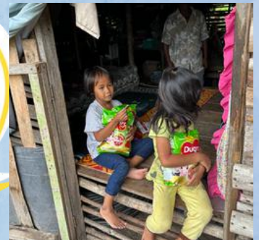
Advent outreach in support of Orang Asli

” Two sisters abandoned with their grandparents after their drug addict father became abusive and their mother left the home