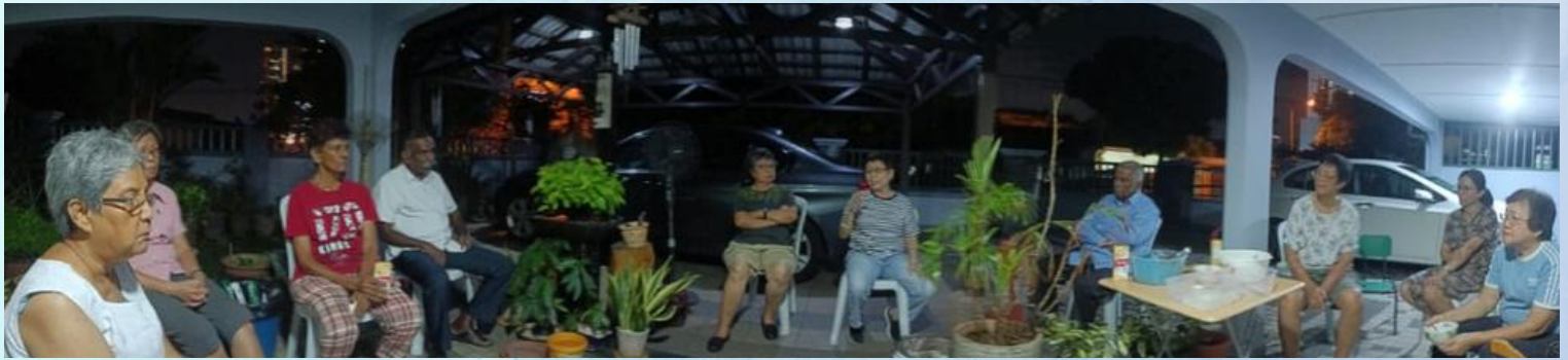
Prayers and fellowship during the Month of the Rosary.