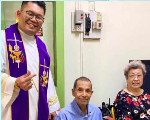
Father Lawrence visits homebound for Advent

” Atem has slight Down Syndrome and stays alone deep in the jungle away from the other villagers.