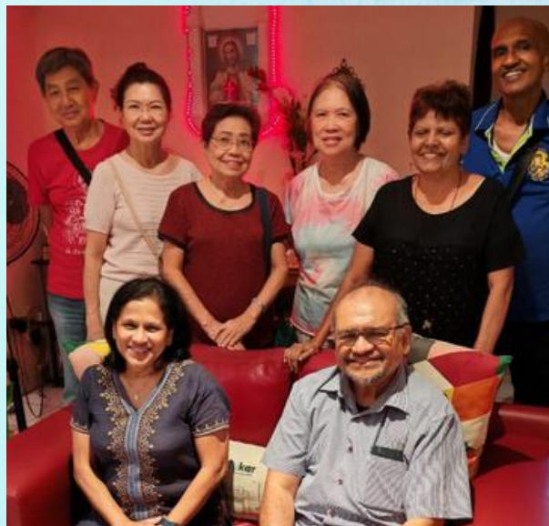
November Prayer Gathering & Election