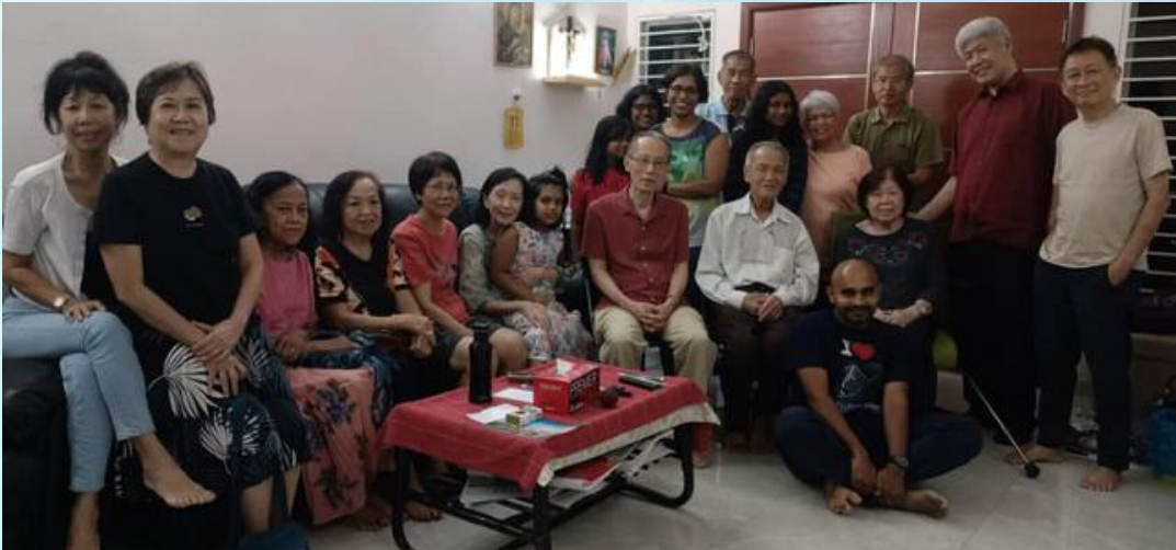
BEC SS3 St Jude