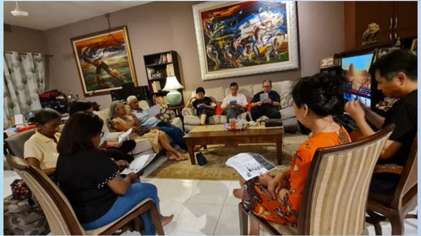
October & November Prayer Gathering