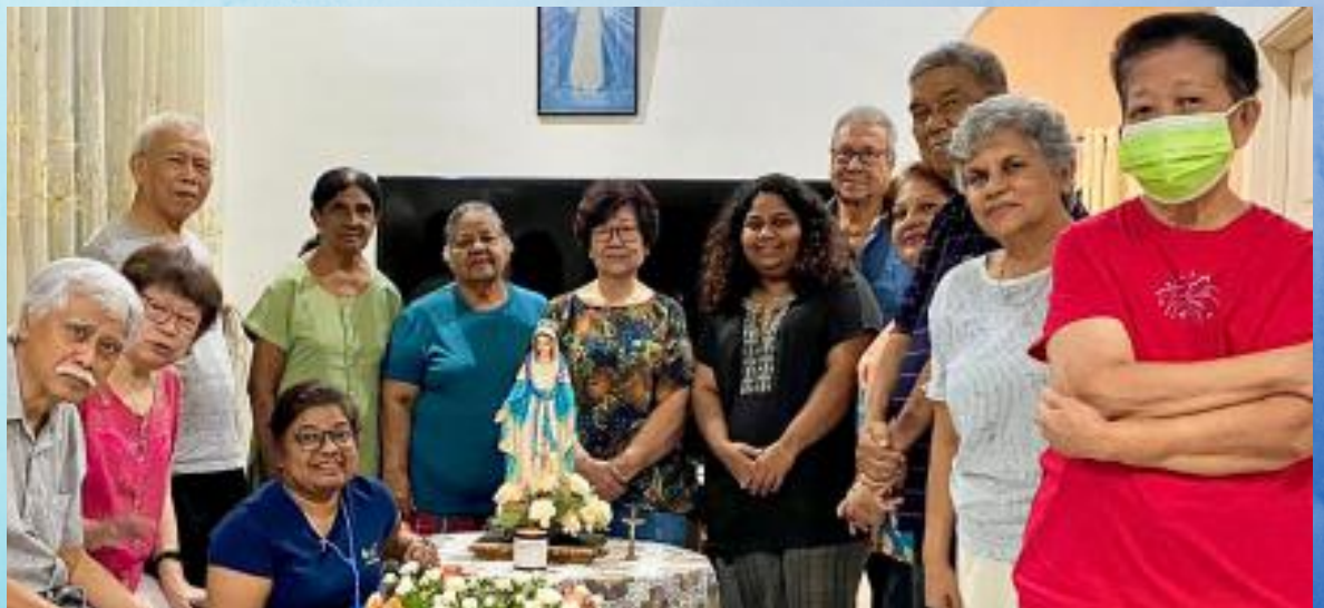
October Rosary Month