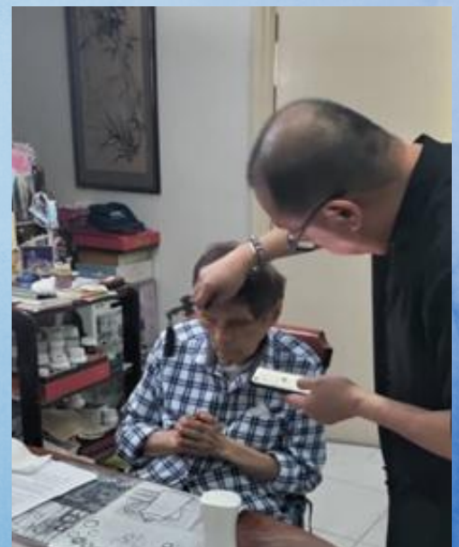
Advent Homebound Visit