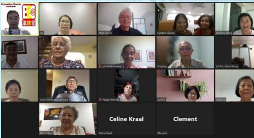
Sacred Heart of Jesus 1st Friday Devotion