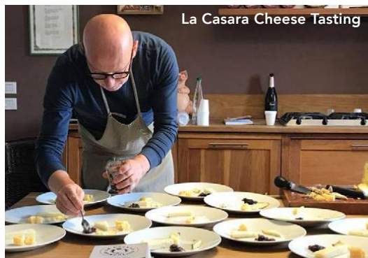
La Casara Cheese Tasting