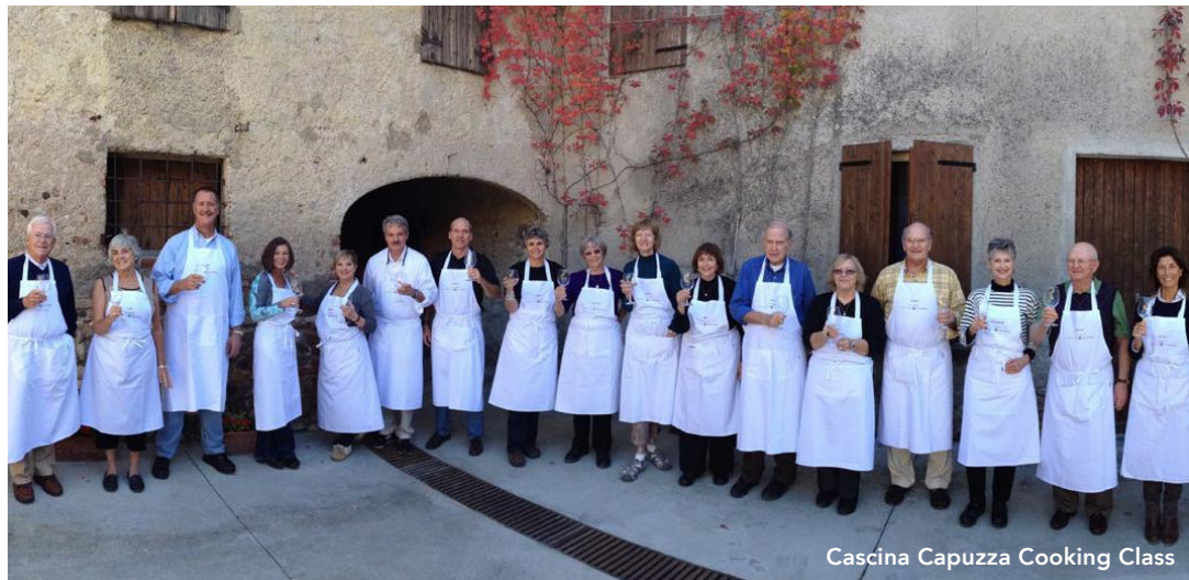
Cascina Capuzza Cooking Class