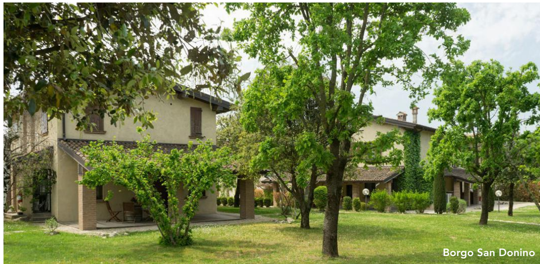
Borgo San Donino