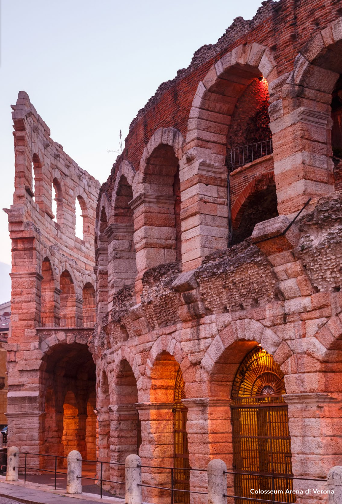
Colosseum Arena di Verona