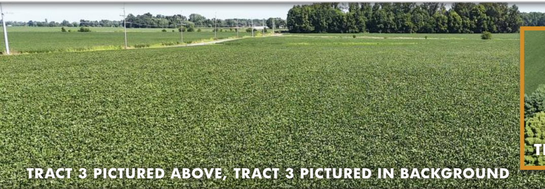
TRACT 3 PICTURED ABOVE, TRACT 3 PICTURED IN BACKGROUND

PRODUCTIVE CROPLAND | POTENTIAL BUILDING SITES SECLUDED HOME | POND | WOODS | CARROLL CO, IN