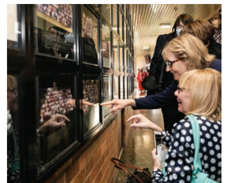
Above: The 2021 Alumnae Reunion Celebrations.