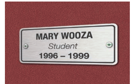
Mockups of the new chairs (left) and the donor plaque (right).

We thank the many alumnae who have supported the project and purchased a plaque. If you missed out on securing a plaque in the first round, the next round of orders is now open and will close on 30 September 2022 — www.womens.uq.edu.au/donations/the-playhouse-naming-opportunities