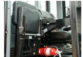
Fully Adjustable Mechanical Seat (Standard)