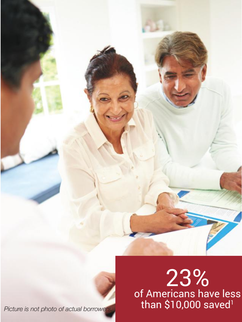
Picture is not photo of actual borrowers.

23% of Americans have less than $10,000 saved 1