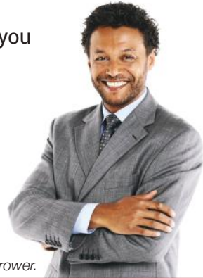
Picture is not photo of actual borrower.

A HECM for Purchase loan combines a reverse mortgage with the equity from the sale of your previous home - or from other savings and assets - to buy your next primary home in a single transaction. Regardless of how long you live in the home or what happens to your home's value, you only make one down payment towards the purchase, provided that you pay taxes, insurance and maintain the property.