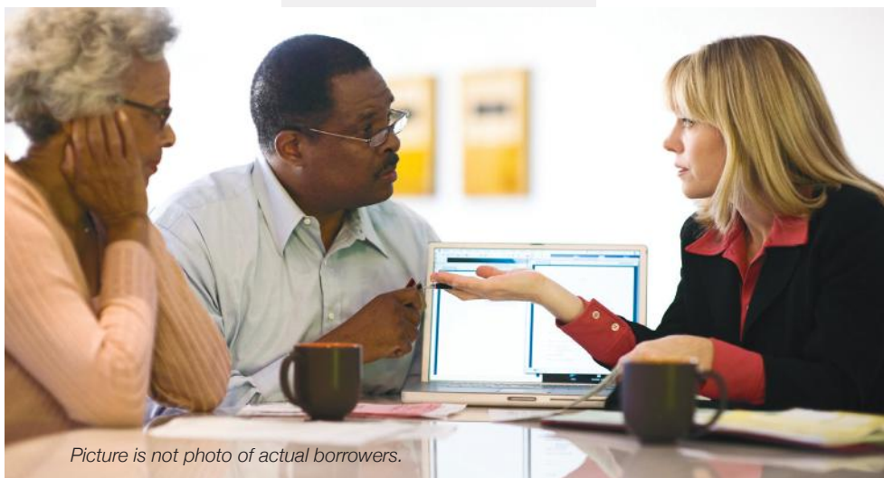
Picture is not photo of actual borrowers.