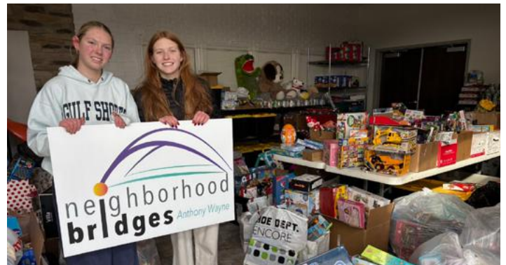
Community Engagement Class students from AWHs hosted a number of service projects, including a toy drive that collected 2600 items for local families.