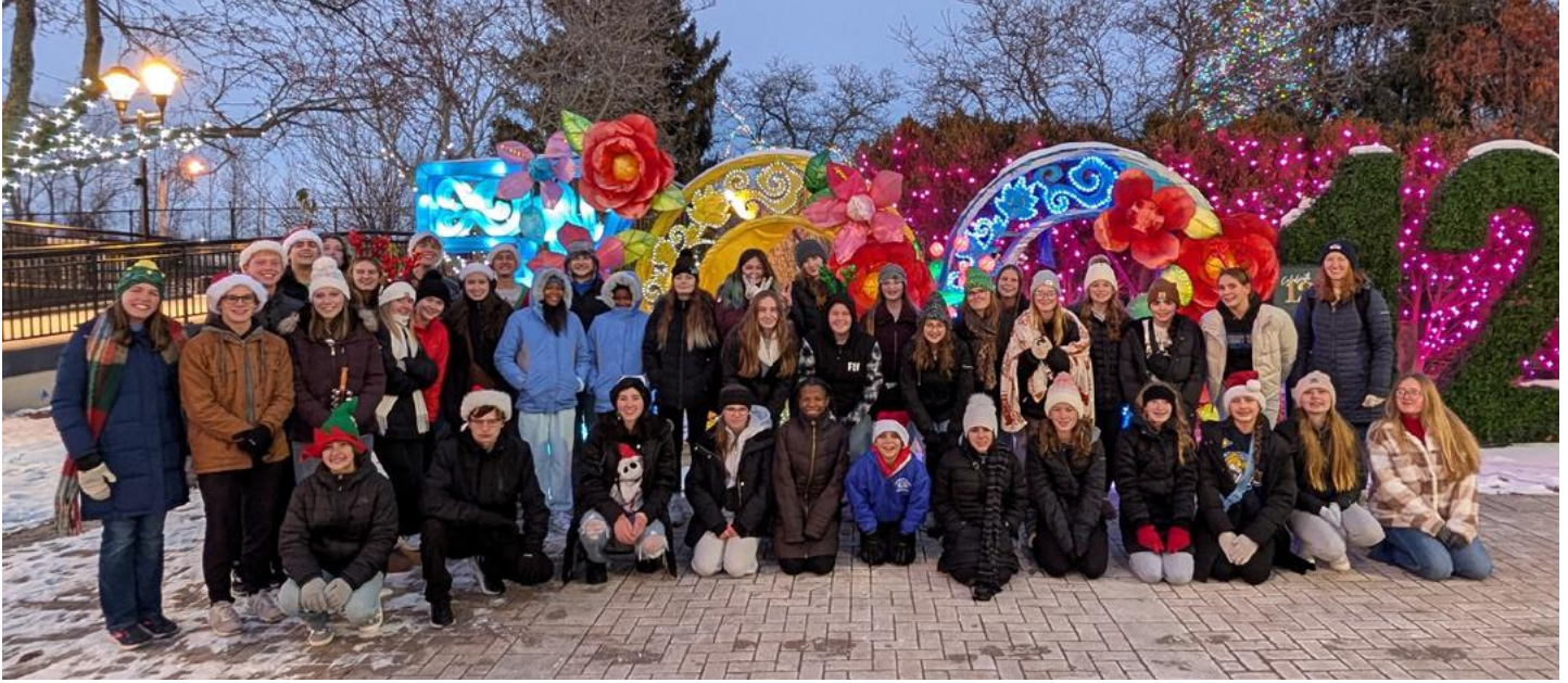
AW Junior High and AWHs Music Departments shared the sounds of the season by performing at the Toledo Zoo's Lights Before Christmas display.