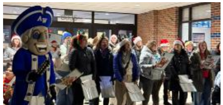
Monclova Primary School staff members shared sweet treats and serenaded students and their families at its 2nd Annual Reverse Caroling Event.