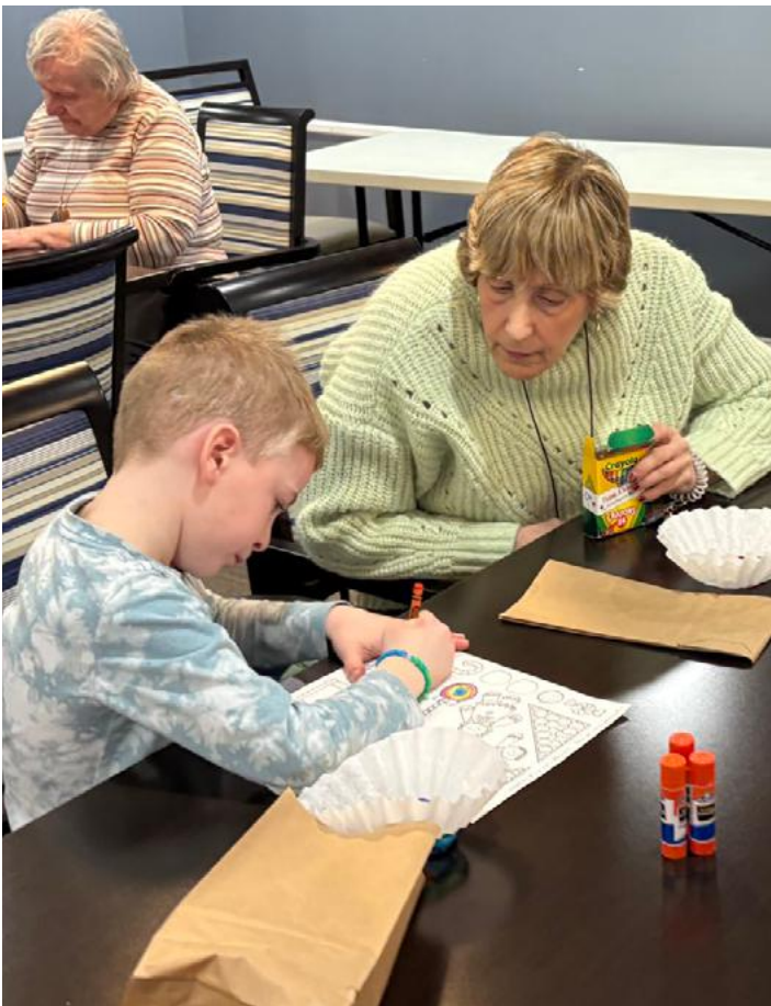
Waterville Primary second grade students visited StoryPoint Senior Living, where they formed friendships across generations by sharing stories and making ornaments.