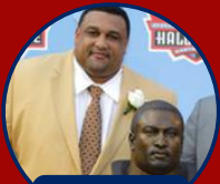
WILLIE ROAF NFL HALL OF FAMER

Offensive tackle 13 seasons. He was first-round pick in the 1993 NFL Draft, and played professionally for the New Orleans Saints and Kansas City Chiefs of the NFL. An 11-time Pro Bowl selection and nine-time All-Pro, he was enshrined in the Pro Football Hall of Fame in 2012 and the College Football Hall of Fame in 2014.