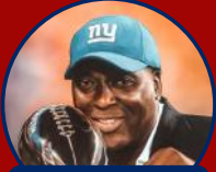
OTTIS ANDERSON SUPER BOWL XXV MVP

Ottis Anderson's 102 rushing yards were the most by any player in Super Bowl XXV, and his touchdown was the game-winner. He also had a key catch for a first down in the Giants' final drive. Anderson's performance was instrumental in helping the Giants defeat the Buffalo Bills 20-19 to win their second Super Bowl title.