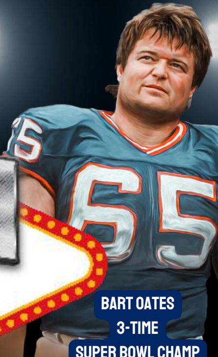
BART OATES 3-TIME SUPER BOWL CHAMP