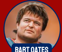
BART OATES 3-TIME SUPER BOWL CHAMP CEO-PRO LEGEND

Bart Oates was a three-time Super Bowl champion center for the New York Giants and San Francisco 49ers. He was a key member of the Giants' offensive line that helped the team win Super Bowl XXI and Super Bowl XXV. He also played a significant role in the 49ers' victory in Super Bowl XXIX. Oates was a versatile and intelligent center who was known for his strength, agility, and leadership. He was also a durable player who started in 136 consecutive games over the course of his career.