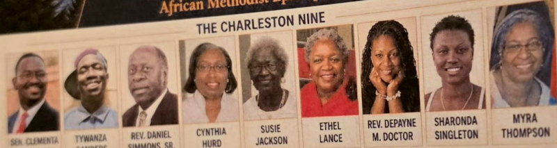
Their lives were taken. Their legacy lives on. We will not forget.