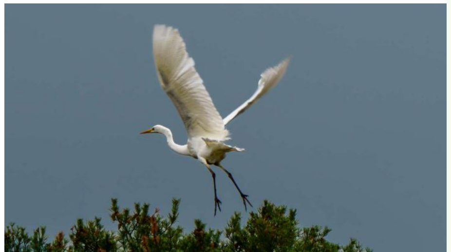
A Great Egret takes flight.

The rain kept falling, and eventually we admitted defeat and headed back the way we had come, at which point of course the rain abated and a few more species performed for us. Amongst them this Great Egret, a bird once rare in Britain, but rapidly becoming a regular sight.