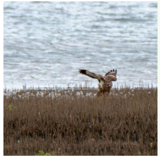
Breakfast for a Buzzard.

We first stopped near a hut used to issue fishing permits. At this point the rain was not a problem, so Nigel was able to point out several species and line up his telescope for everyone to get a better look. Right in front of us, near the shoreline a Buzzard was busy having breakfast – a gory sight, but all part of nature, red in tooth and claw as some remarked. Apologies for the dreadfully bad photo, but I just wanted to point out all the white fluff and feathers – Buzzards are messy eaters it seems!