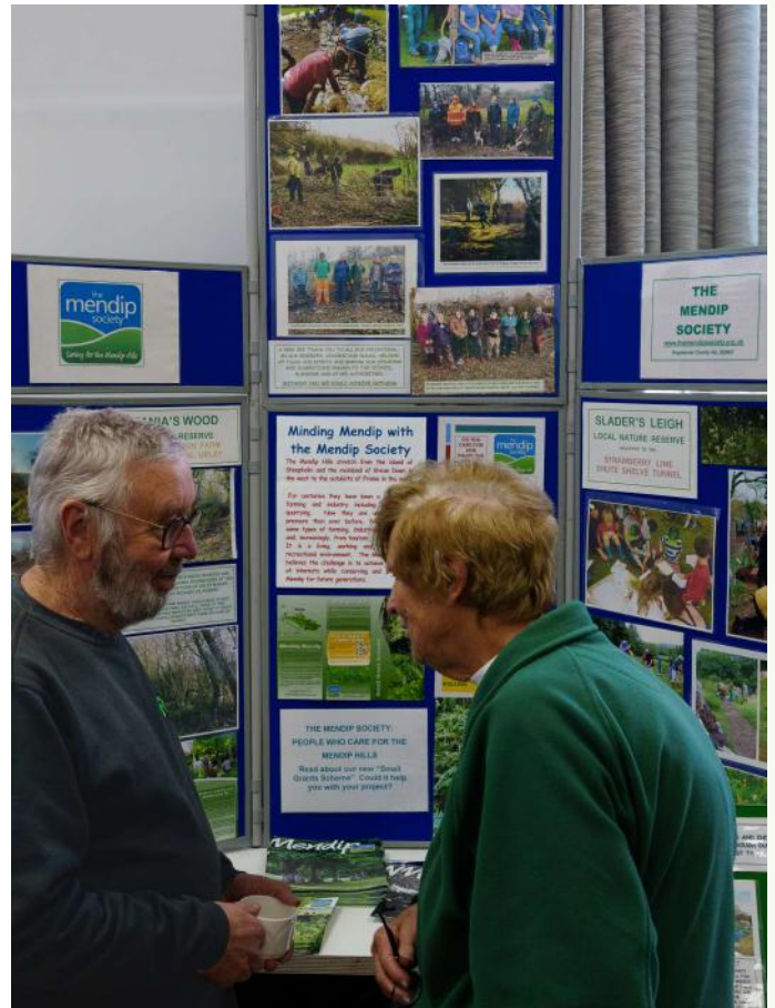
Our stand saw a constant stream of visitors.