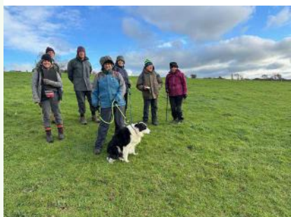
Warm clothing essential!

Despite the postal address of "Roman Road", as far as I can establish Hellenge is not a Roman word. It could have Greek origins and there are similar words in German and Nordic languages. It is possible that the Roman road from Charterhouse to Uphill did run along the crest of Bleadon Hill. In the locality there is evidence of a Roman Villa.