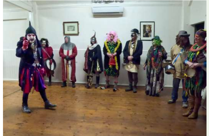
The Langport Mummers acted out a traditional story with a twist.