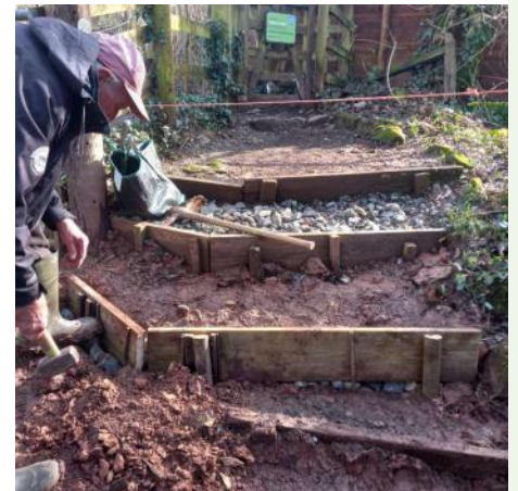
Repairing the top entrance steps. Hard, muddy work!