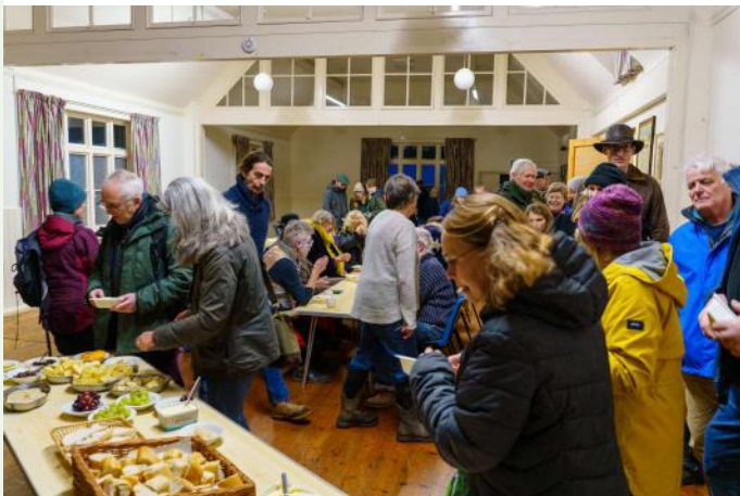
After the ceremony, plenty of bread, cheese - and cider.

This year, for the first time, we sold tickets using our new, online fundraising service, Zeffy. We also held the event earlier in the day in an attempt to attract more families. Both seem to have been highly successful in that we had almost 80 people in attendance, many of them non - (hopefully future) members and including several families. Initial feedback would suggest that the whole event was well received and the increase in numbers certainly added to the atmosphere – not to mention the amount of noise generated to rid the orchard of all possible malign spirits!