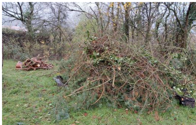
Right: The resulting piles of branches.