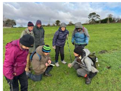
Identifying fungi

We moved into a gated off section of the reserve where a mixed herd of cattle were grazing. Avon Wildlife Trust use grazing on many of their sites, as part of the management plans for those sites. Tina's border collie Bailey and the cattle had a good-natured examination of each other and decided, dog offered no threat to cattle or cattle no threat to dog. Leaving the cattle to return to their grazing we headed down the slope through patches of gorse and scrub. Fern explained how volunteers managed this area to create a mosaic of different habitats. I can imagine that in summer this area is alive with butterflies. The margins on the south facing slopes is where the adders will be found basking. The reserve has a large adder population and is an important site for the adder which is one of the champion species of Mendip Hills National Landscape indicating a good quality grassland habitat.