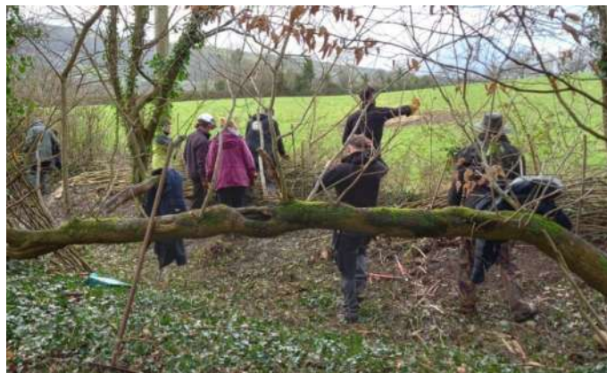
A first taster of hedge laying

Beginners' day on January 31st was fully booked and the day proved dry, fine and productive. The Improvers Day is planned for February, too late to be included here, those who have completed the beginners course will have been contacted directly and invited to attend.