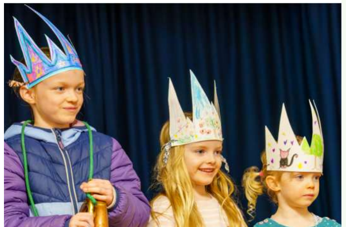
Three princesses - so much better than one!