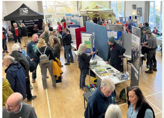
Mendip Connections in Shipham Village Hall.

As always my kindest regards and thanks for all your support. Les