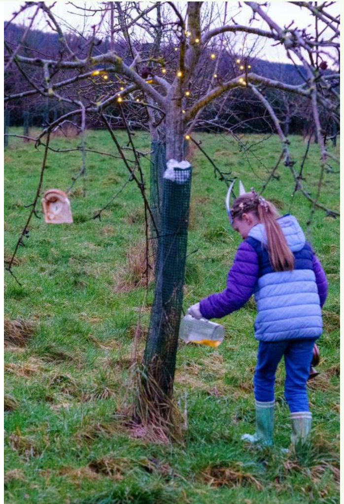
To the orchard where a chosen tree receives offerings of cider & toast.

Spirits banished and traditions respected we then made our way back to the hall where the food had been laid out on long tables and the mulled cider flowed for the rest of the afternoon.