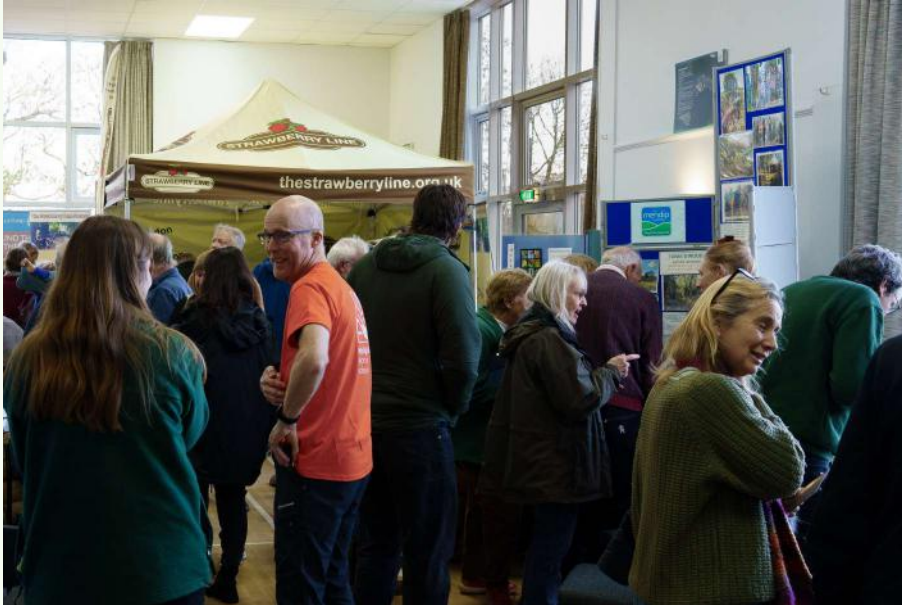
There was a real “buzz” throughout the morning in Shipham Village Hall.

Mendip Connections was billed as “a relaxed and friendly showcase” with a tagline of “Community, Collaboration, Conservation” - which encapsulated the areas it was intended to focus on, but in practice it was so much more. It was a chance for anyone and everyone with an interest in Mendip to come together, see what others are doing, network, learn and discover opportunities - and it delivered in style!