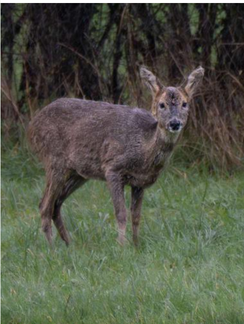
A Roe deer, aware of us, but not too worried.