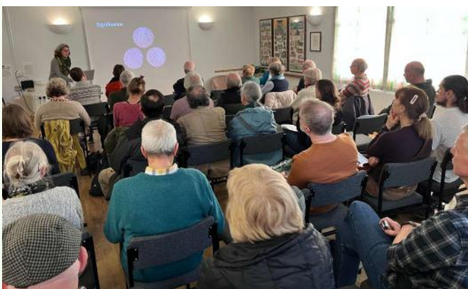
The Chew Valley Hoard presentation was also popular.