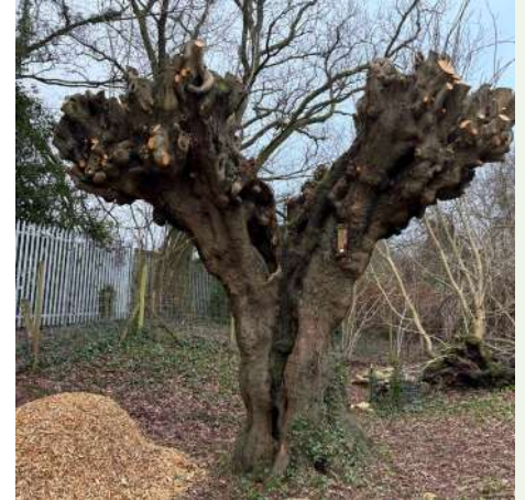
Left to Right: Going, going, gone! The tree surgeons reduce the crown of our standing Small Leaved Lime.

The method used to keep them safe and prolong their life span is to pollard the entire head of the tree above the trunk. So several trusted tree surgeons were invited to tender a bid to do the work, leaving everything clear and tidy afterwards. The selected team were booked to do the work on Thursday 29th January 2026 and accordingly notices shutting the permissive footpath through the meadow were displayed all around, for reasons of public safety. In the event the date on all of them had to be changed quickly as the work was brought forward to Monday 26th.