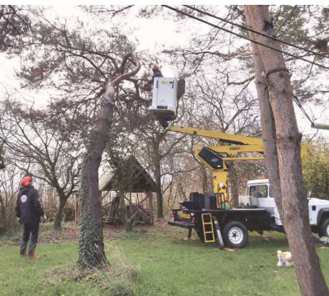
The school shelter, directly under the crown of the leaning tree.

The area where the Forest School children hold their activities and where their shelter also is built contains a number of very well grown fir and pine trees, one of which has been slowly heaving itself out of the ground this past year. It would, if left untended, probably have eventually collapsed right onto the roof of the shelter.