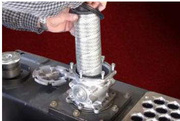
5HSODFHDEOH ,QWHUQDO (OHPHQW) 6WDQGDUG