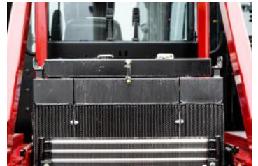
DFK VHFWRU FDQ EH VHUYLF 6WDQGDUG