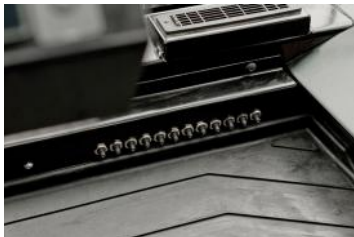
5HVHW 6ZLWFKHV 6WDQGDUG