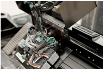
Coded Wiring 6WDQGDUG

7D\ORU /LIW 7UXFNV DUH GHVLJQHG ZLWK HDVH RI PDLQWHQDQFH DQG VHUYLFHDELOLW\ DV D PDLQWHQDQFH FKHFNV DQG WLPHO\ SHULRGLF VHUYLFH DUH WKH NH\ WR \RXU HTXLSPHQW\ V O IURP WKH JURXQG RU UXQQLQJ ERDUG HQVXULQJ WKDW RSHUDWRUV FDQ FRPSOHWH WKHVH U DQG UHPRYDEOH ÀRRU SDQHOV RSHQ WR H\SRVH WKH GULYH WUDLQ DQG K\GUDXOLFV WR SUR