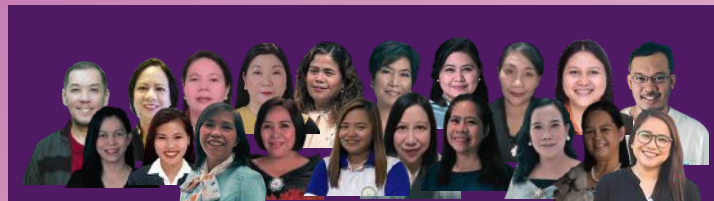
Home-grown Mental Health First Responder Coaches

At present, the RESET Clinic is working on its RESET Master Coach Program with its 20 home-grown First Responder Coaches.