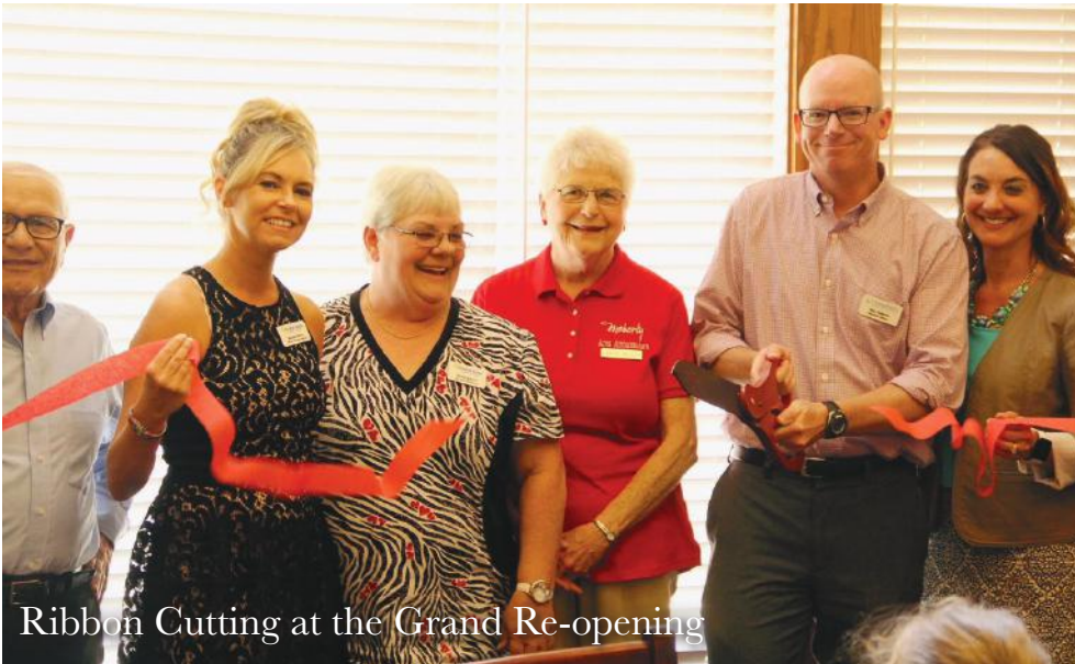
Ribbon Cutting at the Grand Re-opening