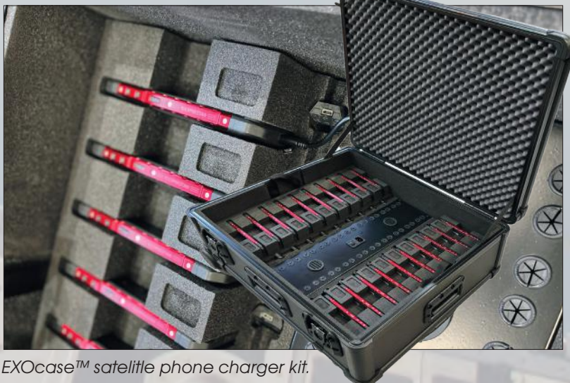
EXOCASE™ satellite phone charger kit.