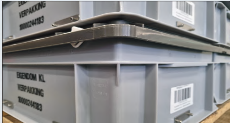
Military Normboxes have besides straps and foam, standard drip-proof lids (IP 51).

One of the most vital military operations is logistics. History has shown numerous instances where inadequate logistics compelled an army to retreat. Almost everything an army requires is transported to the frontline. In this context, robust packaging is essential. For non-corrosive goods or spare parts in plastic bags, our Normboxes™ are perfectly affordable solutions.