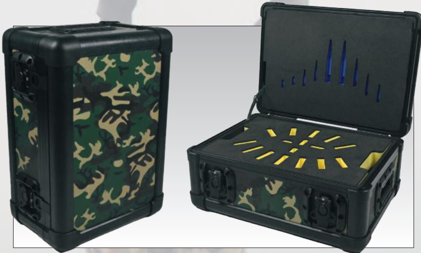
Exocase™, available in any camouflage pattern, the absolute top in fabricated cases.

Our EXOCASE™ is a further development of the well-known flightcase. It combines the convenience of a fabricated case with the durability of a moulded transit case. The EXOCASE™ unique "exoskeletal" design ensures maximum protection of its content during storage and transportation. Unlike flightcases, the outer poly urethane corners and ABS profile protection make our EXOCASE™ extremely shockproof and thus fall resistant. Testing for UN approval classification "X" poses no problem for the EXOCASE™.