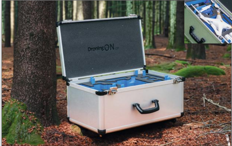
Smartcase™ containing a light drone.

Our Smartcases™ are in fact "flightcases light" They offer the same flexibility in design but with much sleeker profiles and are a lot easier to carry. Naturally, for bulkier products, when stacking is needed for storage or transport, we are happy to design/produce a flightcase. Besides options like coloured or printed panels made of rugged honeycomb plastic, we also supply black extrusions and grips as a standard option.