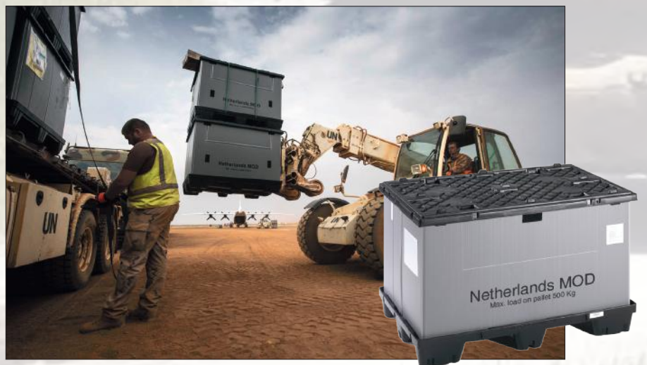
Lightpack assembled, 1200x1000x940 mm. (at series of minimum 100, we will supply the collar to your specification).