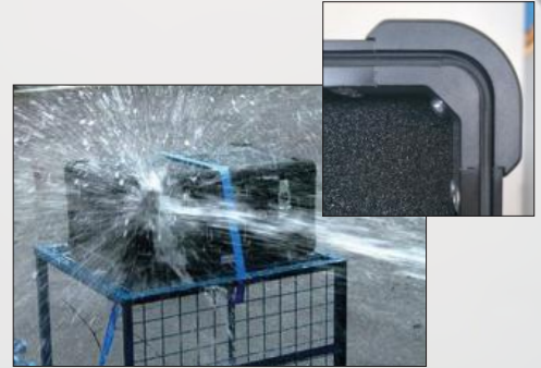
EXOCASE lids have standard neoprene joints and provide IP 56 protection.