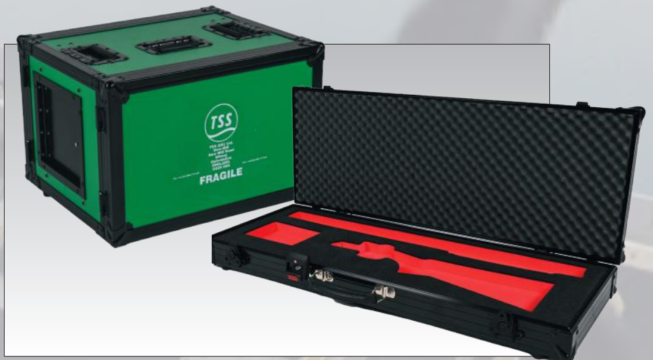
Classic flightcases, with an extra touch: multicoloured foam, black accessories.

ATA (Air Transport Association) specification 300 is often used as a standard for cases in the USA. There are various, DEF STAN and MIL-SPEC standards that apply to the transportation of goods for military application in Europe and the USA. Our design team is well aware of these, and our cases comply where necessary.