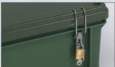
Extra option: stainless steel closure, can be provided with a padlock.

One of the most vital military operations is logistics. History has shown numerous instances where inadequate logistics compelled an army to retreat. Almost everything an army requires is transported to the frontline. In this context, robust packaging is essential. For non-corrosive goods or spare parts in plastic bags, our Normboxes™ are perfectly affordable solutions.