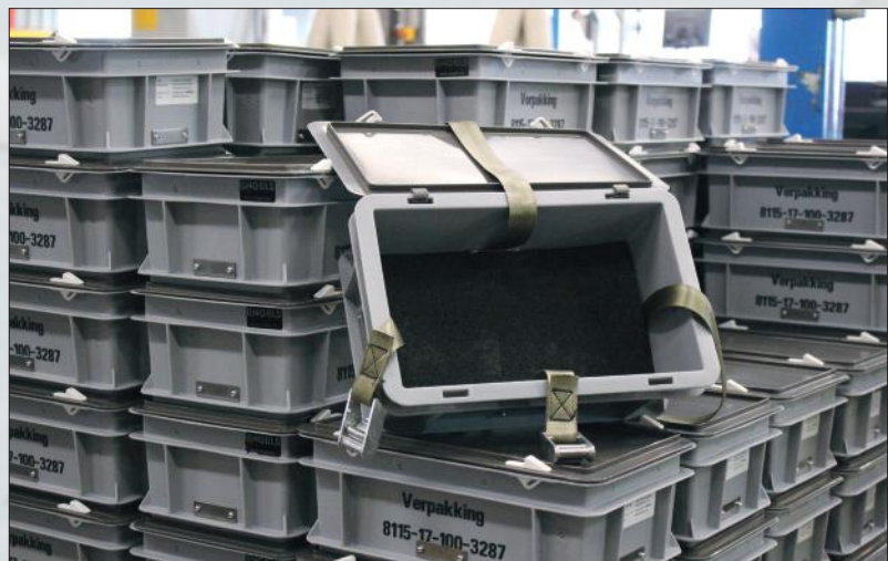
Strong, drop resistant (according to UN standard 4H2 level x) boxes, sizes in between 5 and 90 litres, mounted with straps for fixation of spare parts, electronics and such.