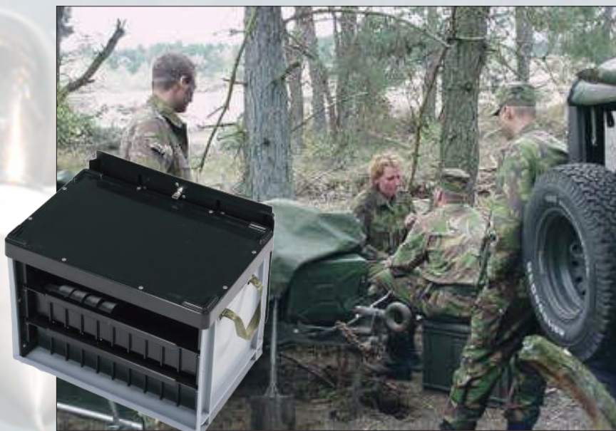
First aid kit for first line use.

Interior for vertical transport and storage of bottles with pressurized air or oxygen. Many have been supplied to disaster relief units such as the French SSID's and Dutch Regional Fire-fighter units.