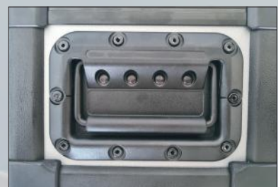
Strong ergonomic handles.