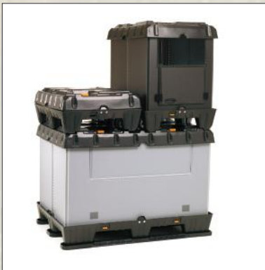
We supply Lightpack pro collars also "made to measure".