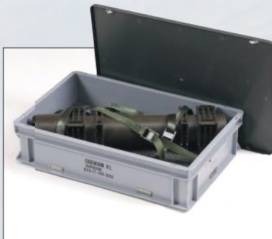
Straps and foam instead of shock absorbing filling material.