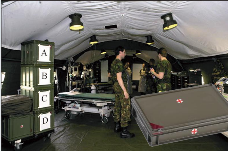
Normboxes in a field hospital. Not only for bandages, but also for bottles of nitrous oxide.

Field hospitals and medical support also require a significant amount of packaging. During peacetime, we build up our stock. When needed, bandages, medicine, and anaesthetics must arrive at the scene in large quantities, in good condition and easily accessible. Once again, Engels Group boasts a wealth of experience. This page showcases a selection of projects from our portfolio.