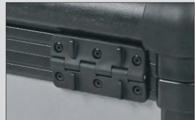
Strong, moulded hinges.