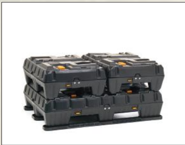
Lightpack pro modular, size 1200x800 mm and 800x600 mm.

We supply two versions of foldable containers. When used in bulk, we advise our classic Lightpack, where, when empty, pallets and lids are shipped in separate stacks. As RTP (reusable transport packaging) shipped empty as complete sets, we offer our Lightpack pro. Here, when empty, pallet, sleeve and cover form one unit.