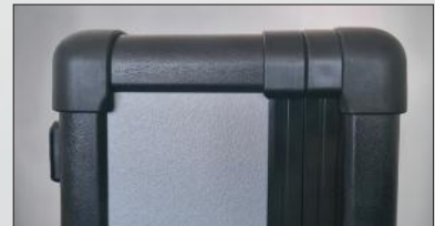
Polyurethane corners and ABS profiles covering the inner structure of a EXOCASE™ absorb shocks.