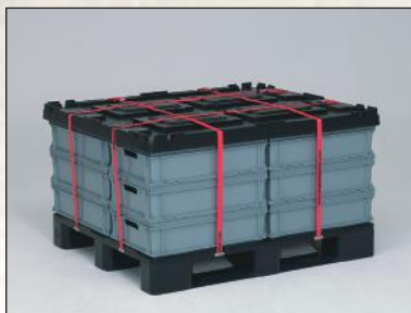
We offer several versions multi-use covers and pallets to ship our normboxes™.

Often military transport goes by air, especially on foreign missions. Weight and stability of packaging play a mayor role in the process. Engels supplied the Netherlands MOD pallets, collars (3 different heights) and lids that have proven their durability since the mission in Afghanistan.