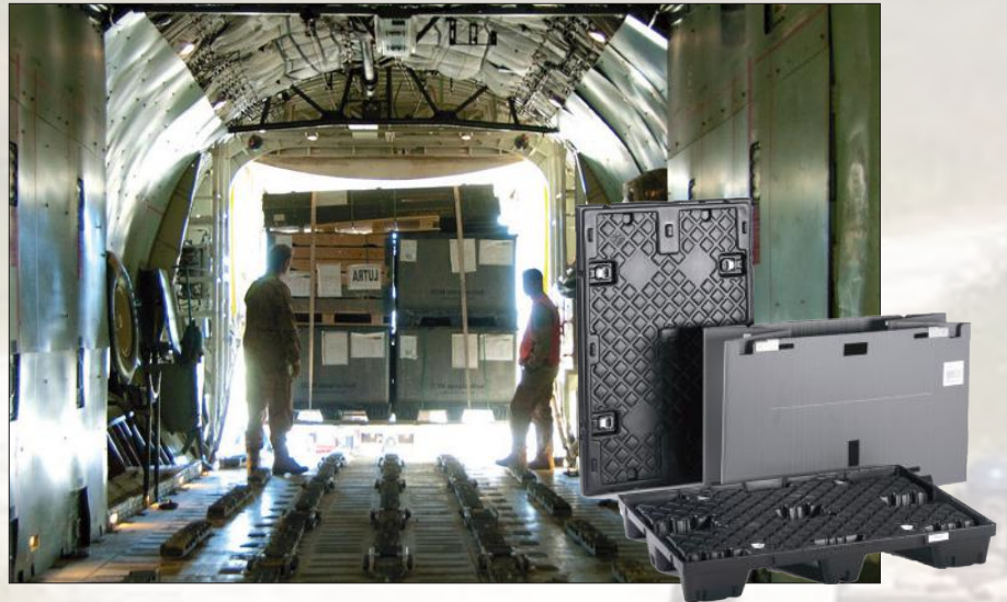
Lightpack Pallets and lids are shipped in stacks when empty, the folded collars fit together on a pallet with collar set up. Savings in empty return volume: 85%.

Often military transport goes by air, especially on foreign missions. Weight and stability of packaging play a mayor role in the process. Engels supplied the Netherlands MOD pallets, collars (3 different heights) and lids that have proven their durability since the mission in Afghanistan.