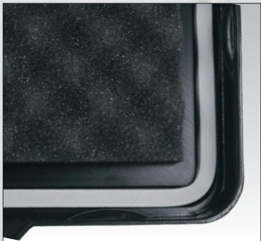
Extra option: lid with neoprene joint, splash proof (IP 53).