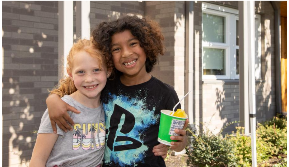
Kids pose at a Start School Right event in Hillsboro.

REACH took significant steps to preserve the long-term viability and affordability of our properties while addressing climate and resiliency needs. We secured public and private funding to enhance energy efficiency and climate resilience, ensuring that our properties remain sustainable and supportive for our most vulnerable populations.