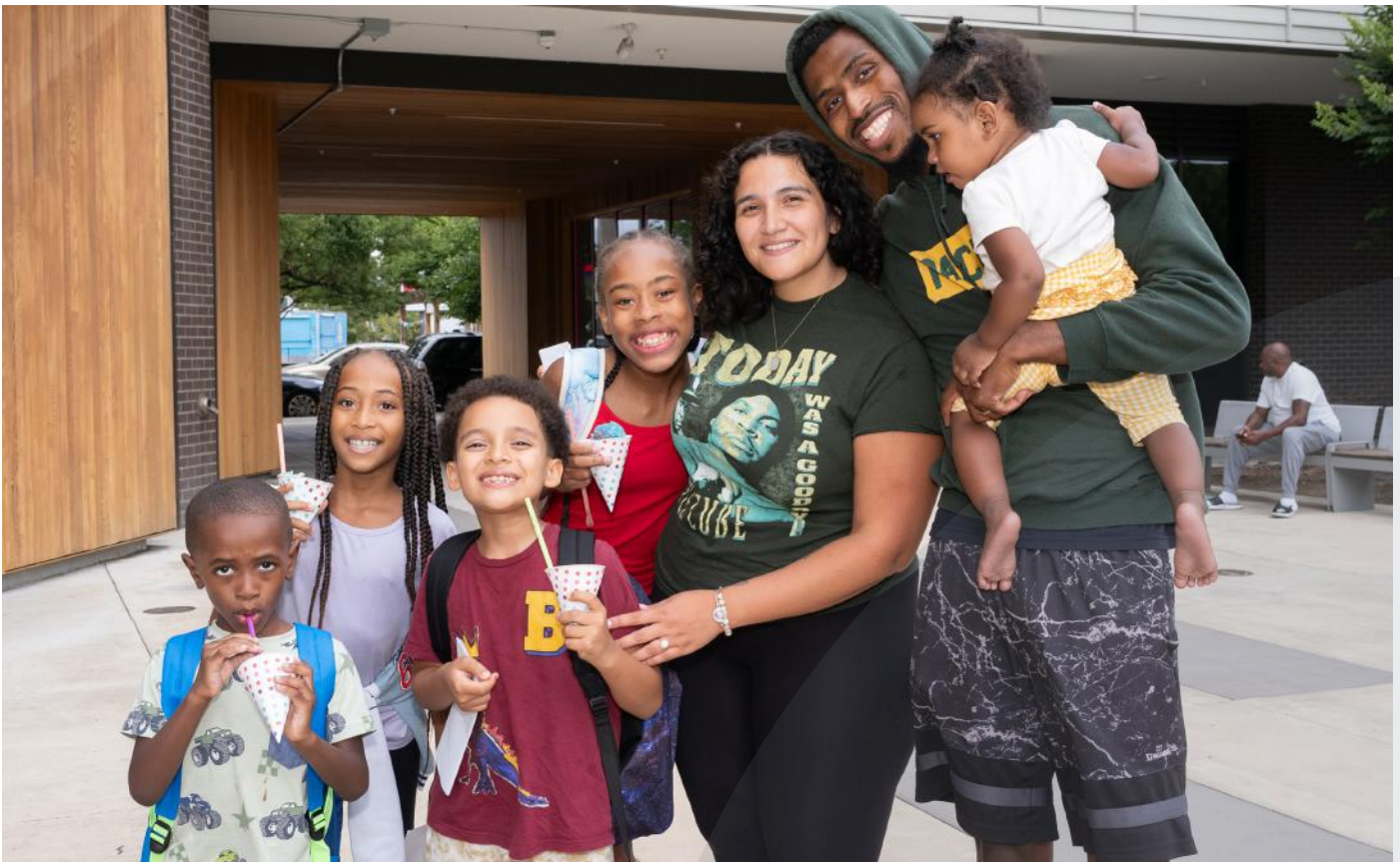
PHOTO: Family poses at Start School Right event in SE Portland.