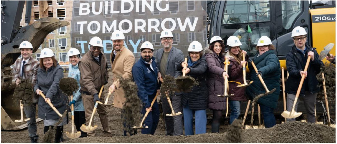
PHOTO: REACH and partners celebrate the ground breaking of an affordable community at Elmonica Station.

Expanded affordable housing with the opening of Plaza Los Amigos and the groundbreaking of Elmonica Station.