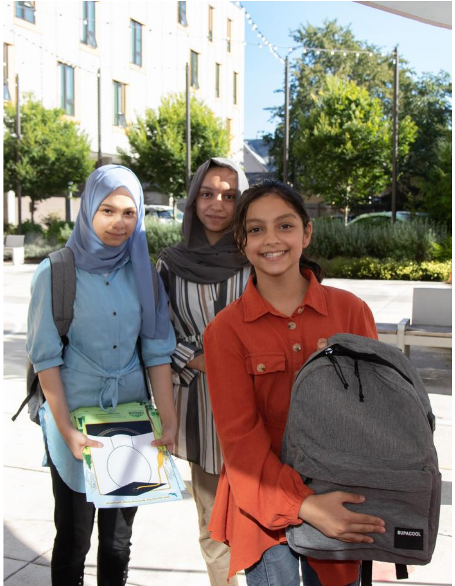
PHOTO: Kids receive backpacks at a Start School Right event in SE Portland.

REACH received a grant from the Oregon Community Foundation to access Esusu, to help renters build credit and financial security. This pilot program, in partnership with Hacienda and Northwest Housing Alternatives, aims to build stability for our residents.