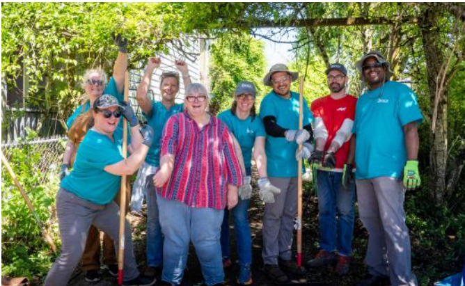
PHOTO: Clean up team poses at the NeighborWorks event with REACH's Community Builders Program.

This investment will improve the livability of our properties, reduce energy costs for residents, and lower their environmental impact. It marks an exciting chapter for REACH as we continue to build and preserve homes that support both the well-being of our residents and the health of our planet.