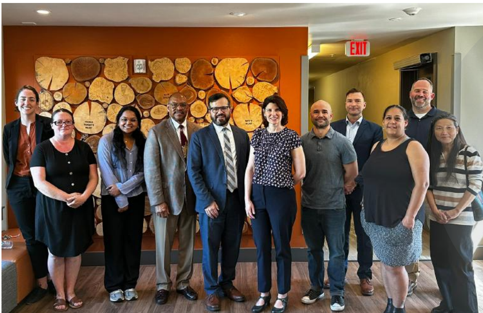
PHOTO: HUD Officials tour REACH's Orchards at Orenco as Part of National "Road to Innovation" Tour.