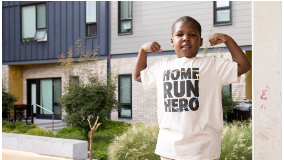
PHOTO: Young boy shows off his muscles at Renaissance Commons in North Portland.

To address disparities among Black, Indigenous, and People of Color (BIPOC) communities, REACH worked to create new pathways to homeownership and wealth building in 2024. By partnering with community-based organizations, we aim to reposition single-family homes within the SE Portland portfolio, fostering increased homeownership opportunities and wealth creation for first-time homebuyers.