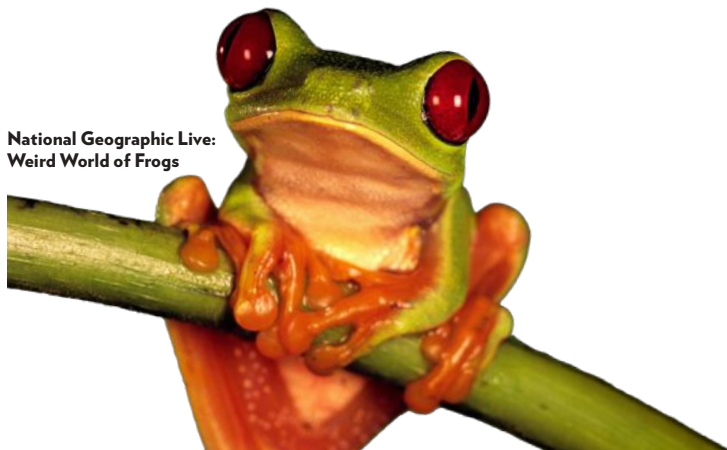
National Geographic Live: Weird World of Frogs