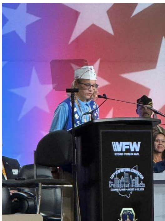
VFW National Home Poppy Child of the Year