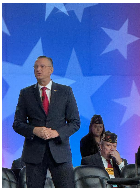
Secretary of the VA, Douglas Collins