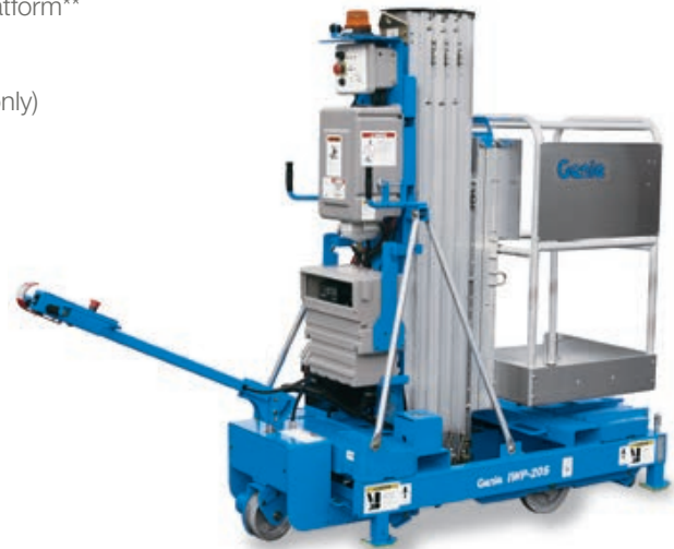
Shown with optional power wheel assist

* Adds 12.5 in (.32 m) to unit length and 285 lbs (129 kg) to unit weight, DC only ** Not available with Outreach package